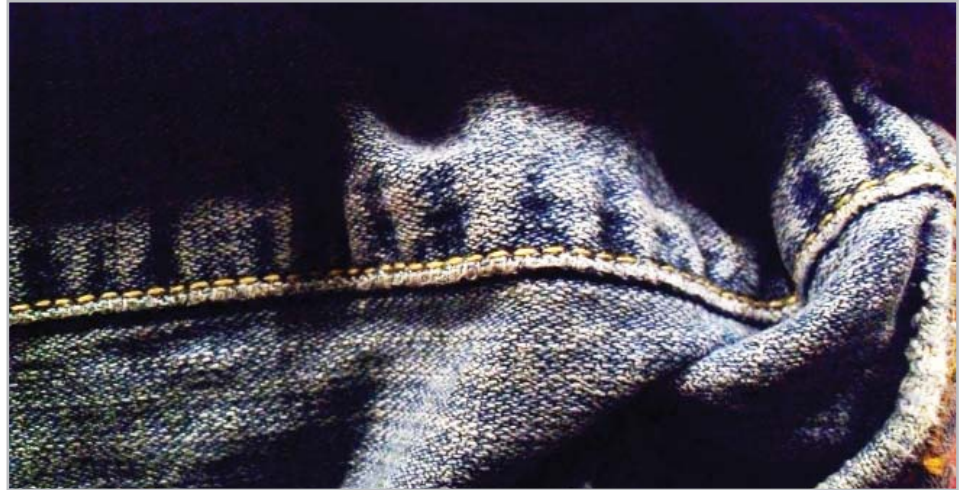
A simple thing like denim has come to represent a movement against sexual violence. Schinnen's Denim Day 5K Walk/Run is just one of the events held in USAG Benelux military communities that address the problem of sexual assault and promote victim advocacy.

USAG Benelux puts on the Sexual Harassment/Assault Response and Preven-