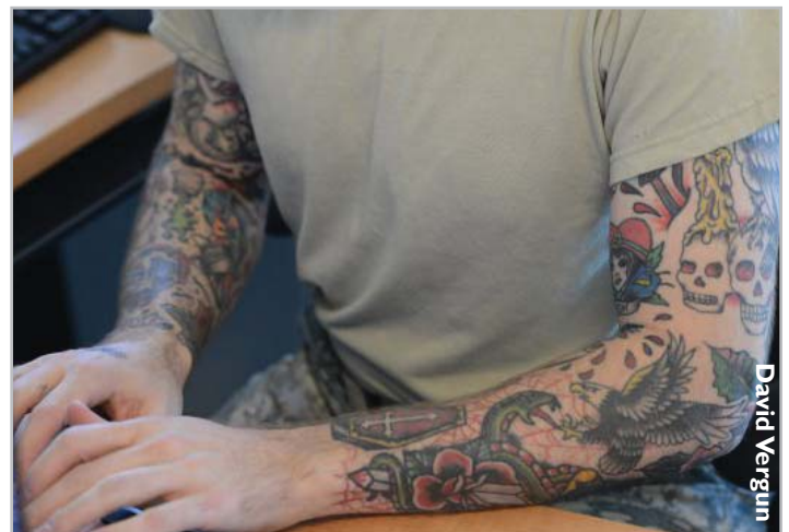
A Soldier displays his tattoos grandfathered in under the current Army Regulation 670-1. The number and size of tattoos on the arms and legs will be less restrictive under an updated policy, Army Chief of Staff Gen. Raymond Odierno says will soon take effect.

"I've talked to our sergeants major and our non-commissioned officers and some of our officers and frankly, society is changing its view of tattoos, and I think we need to change along with it." Gen. Raymond Odierno