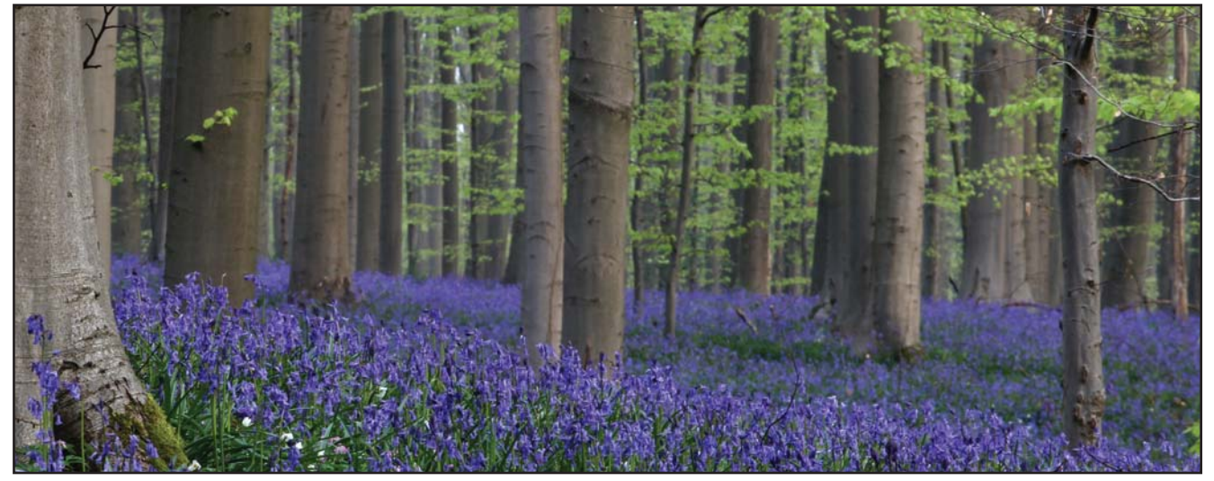
Blooming bluebells carpet the forest floor in the Blue Forest in Halle, Belgium, Wednesday, April 22, 2015.