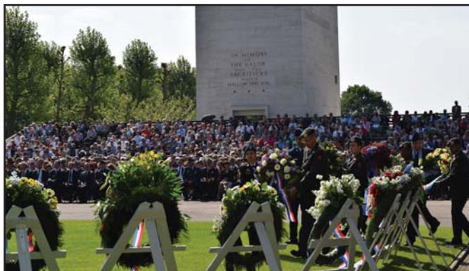
A total of 77 wreaths were laid at the Memorial Day ceremony at Netherlands American Cemetery in Margraten, the Netherlands, Sunday, May 24, 2015. More than 6,000 people attended.