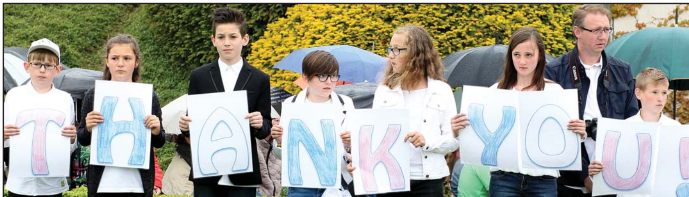
Schoolchildren from Plombières say thank you at Henri-Chapelle American Cemetery ceremony Saturday, May 23, 2015.

For 80 years at Flanders Field American Cemetery, the schoolchildren of Waregem have sung "The Star-Spangled Banner" to honor the Americans buried there, a moving tribute to America that brought tears to many Americans attending the ceremony.