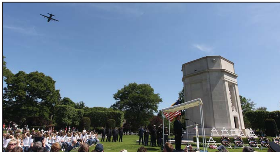
The fly-over at Flanders Field American Cemetery.