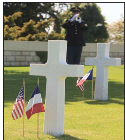
Memorial Day ceremonies were held in 16 locations around Europe. Taps is played at the Somme American Cemetery in Bony, France, Sunday, May 24, 2015.