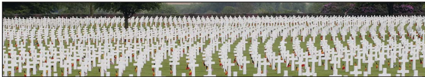
Crosses are decorated with Belgian and American flags at Henri-Chapelle American Cemetery Saturday, May 23, 2015.