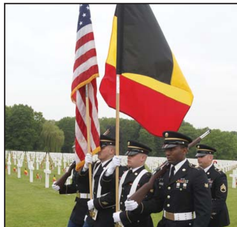
USAG Benelux Color Guard marches at Ardennes American Cemetery Saturday, May 23, 2015.