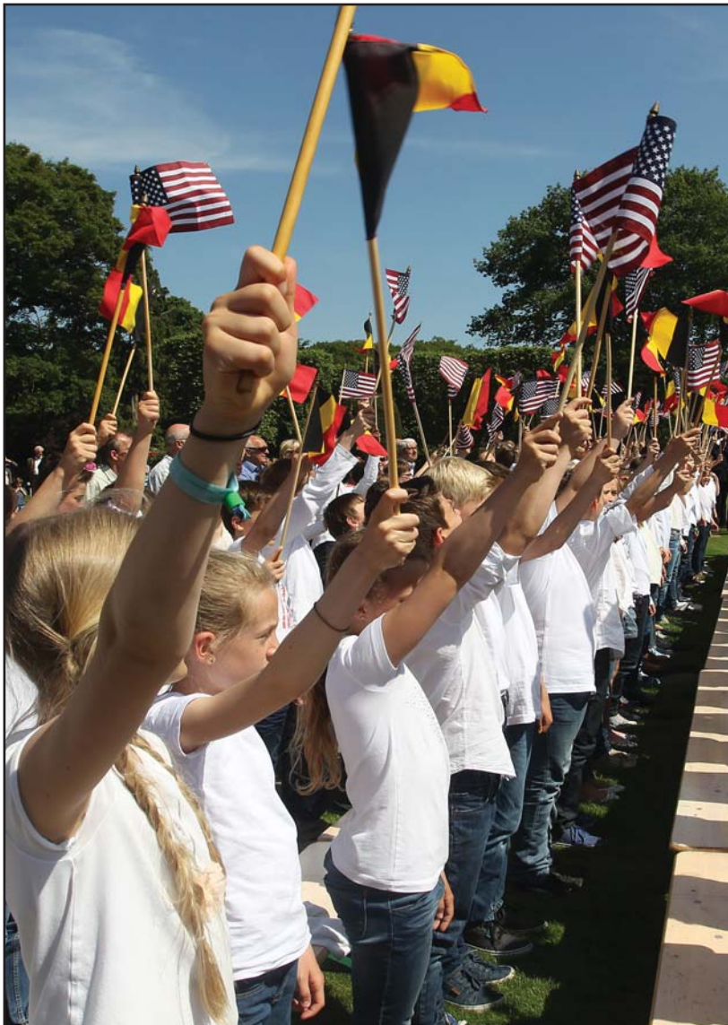
Waregem schoolchildren wave Belgian and American flags at Flanders Field American Cemetery as they sing "The Star Spangled Banner" Sunday, May 24, 2015.