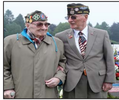
Two World War II vets are guests of honor at the Henri-Chapelle ceremony Saturday, May 23, 2015.