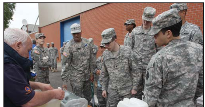
A demonstration on hazardous materials by civil protection authorities drew a crowd.