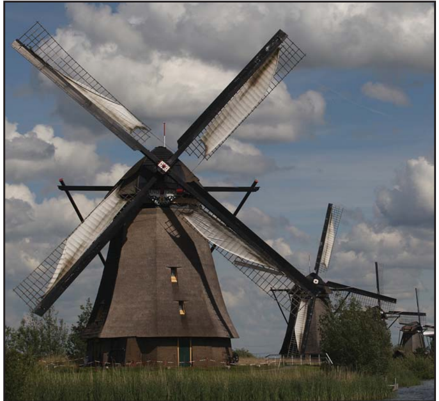
Kinderdijk means childrens dike in Dutch. While it's always free to walk the pathways and view the mills, a museum on the site has a small fee.

For your GPS: Kinderdijk 2961 the Netherlands From: Mons: 205 km Brussels: 141 km Schinnen: 183 km