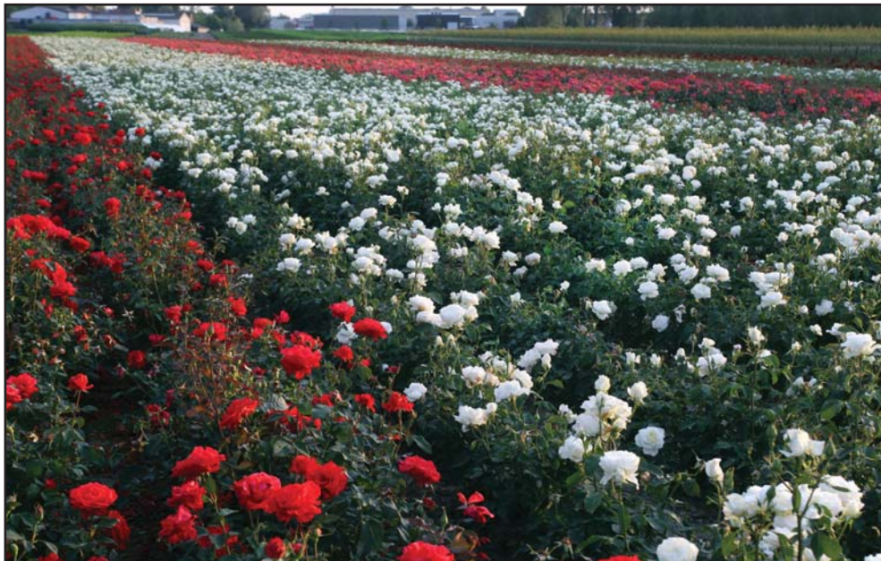
A picturesque field of colorful begonias near Lochristi, Belgium, Monday, Aug. 11, 2015. At right, more begonias.

Every two years, Le Tapis de Fleurs de Bruxelles decorates the city's Grand-Place with an intricate design fashioned entirely of begonias. The floral carpet will celebrate its 20th anniversary in Brussels Aug. 12 to 15, 2016.