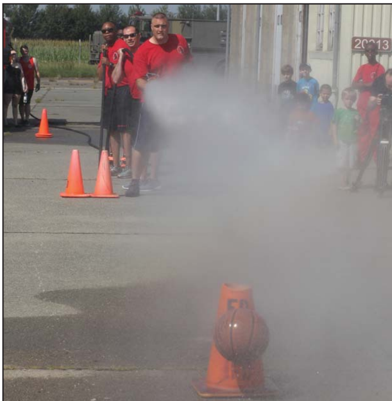
The leadership team of the 424th Air Base Squadron knocks the basketball off the cone while competing in the team relays at the fire muster Friday, Aug. 7, 2015.

The highlight of the Chièvres muster was a team relay event. The fastest team to finish all the events and be named winners of this year's muster was Team Tower.