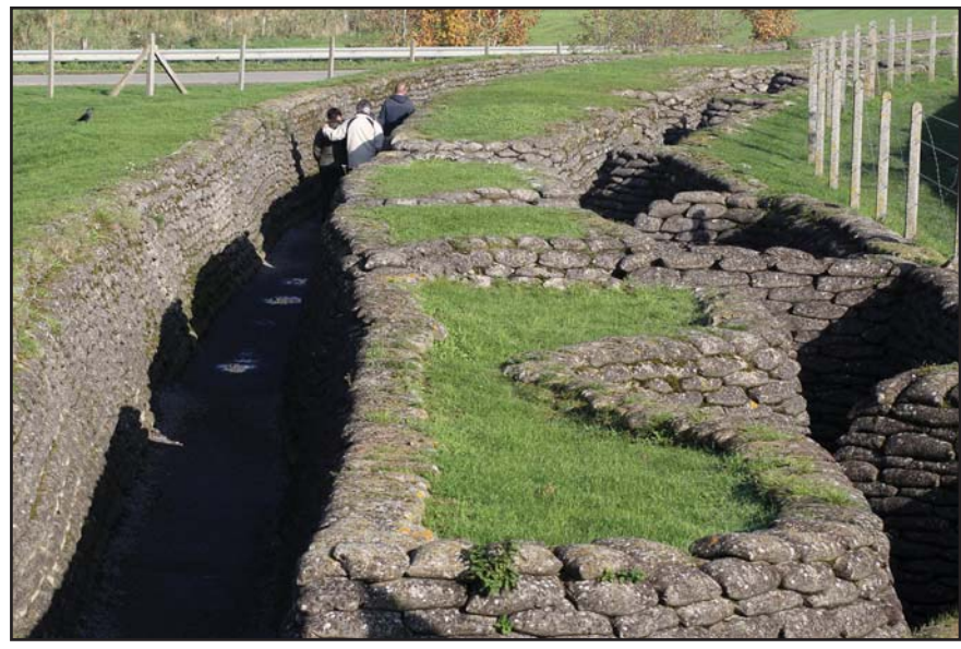
(From top) World War I weapons are on display at the museum. • Visitors walk through the preserved trenches Saturday, Oct. 31, 2015.• A view of the trenches from a bunker. • A Belgian army uniform can be seen at the museum.