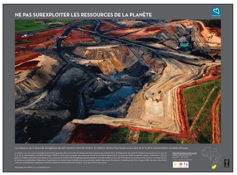
See this GoodPlanet image and others like it in large scale during USAG Benelux Recycling Week.

Learn more about Recycling Week by calling the Environmental Division at DSN 361-5612 or civilian 068-275612.