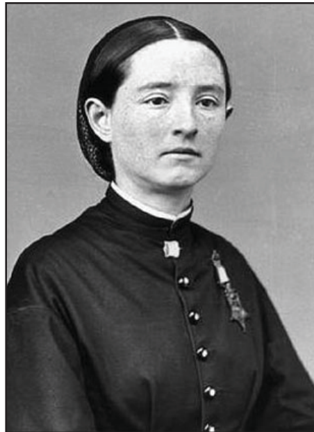
Dr. Mary Walker wearing her Medal of Honor

In 1862, Walker moved on to Virginia, this time treating the wounded at field hospitals throughout the state. In 1863, her medical credentials were finally accepted, so she moved to Tennessee, where she was appointed as a War Department surgeon. Her position was paid, and it was the equivalent of a lieutenant or captain.