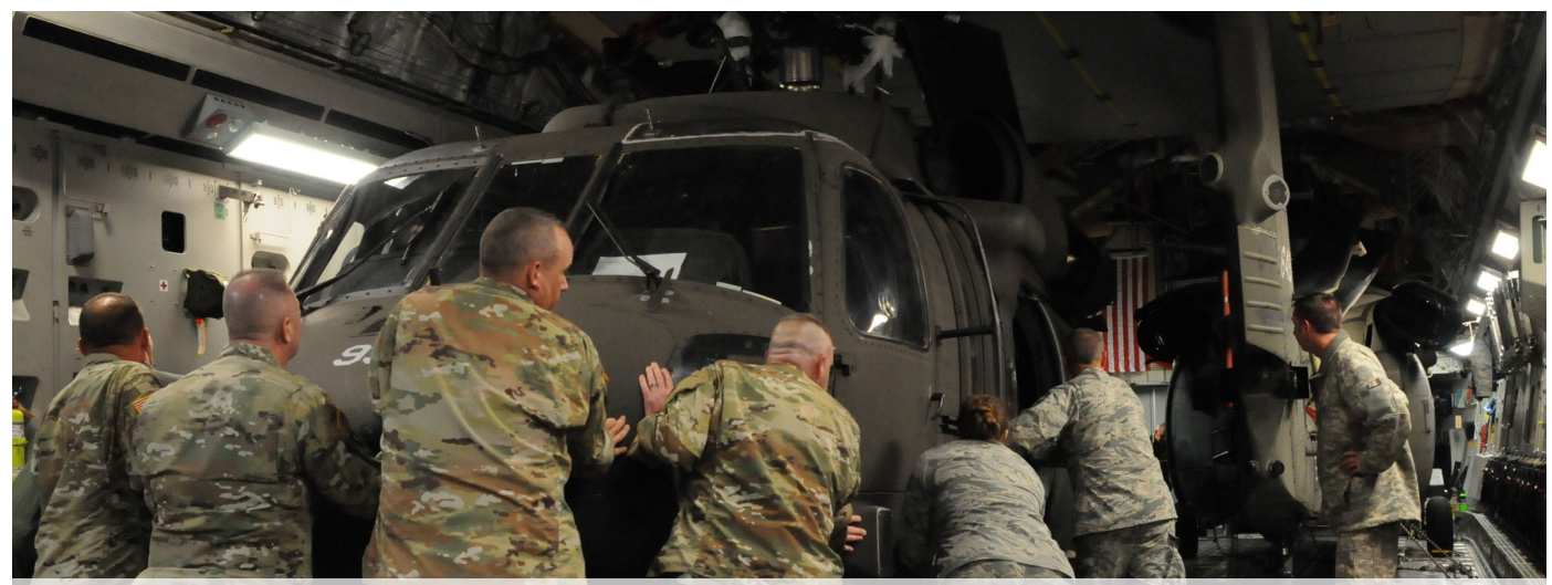
Airmen from the 172d Airlift Wing and Soldiers of 1st Battalion, 230th Aviation Regiment, load a UH-60 Blackhawk Sept.13, 2017, onto a C-17 Globe-master III assigned to the 172d. The two Mississippi National Guard units worked together to transport necessary supplies to the U.S. Virgin Islands, for Hurricane Irma relief.