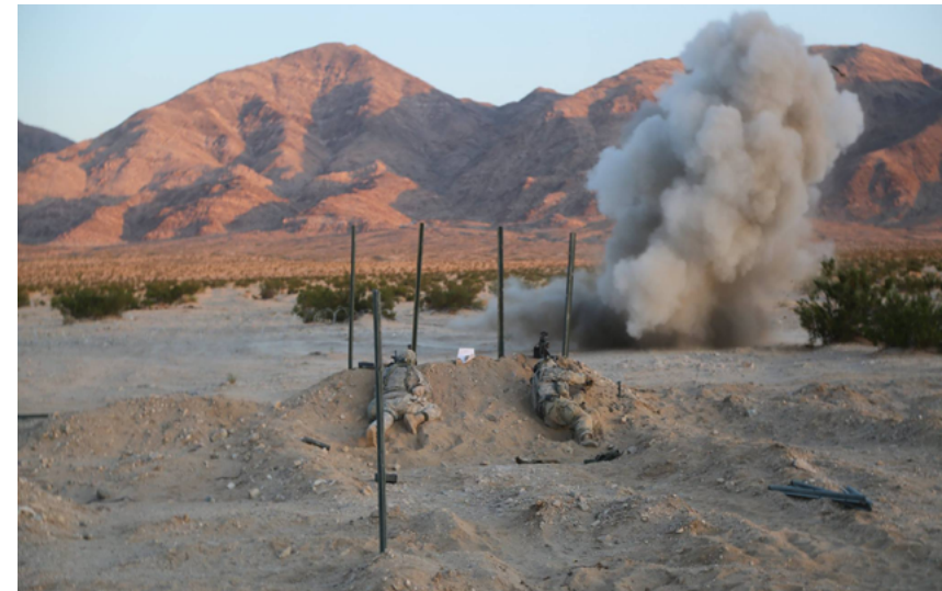
Top: U.S. Army Soldiers assigned to 2nd Brigade Combat Team, 2nd Infantry Division, detonate a claymore during Decisive Action Rotation 17-09 at the National Training Center in Fort Irwin, Calif., Sep. 22, 2017.