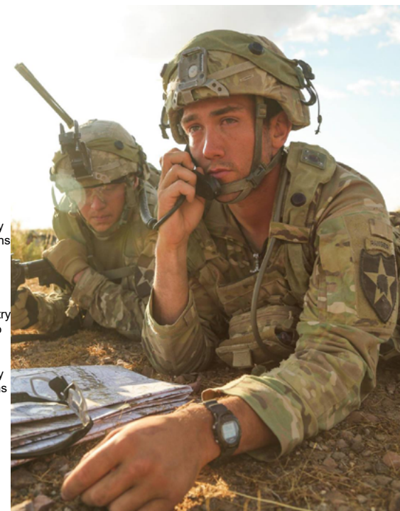
Right: U.S. Army Soldiers assigned to 1st Battalion, 17th Infantry Regiment, 2nd Brigade Combat Team, 2nd Infantry Division, communicate over their radio during Decisive Action Rotation 17-09 at the National Training Center in Fort Irwin, Calif., Sep. 17, 2017.