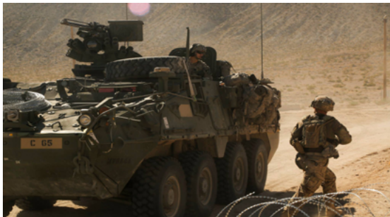
Above: U.S. Army Soldiers assigned to 2nd Brigade Combat Team, 2nd Infantry Division, arrive to evacuate simulated wounded Soldiers during Decisive Action Rotation 17-09 at the National Training Center in Fort Irwin, Calif., Sep. 12, 2017.