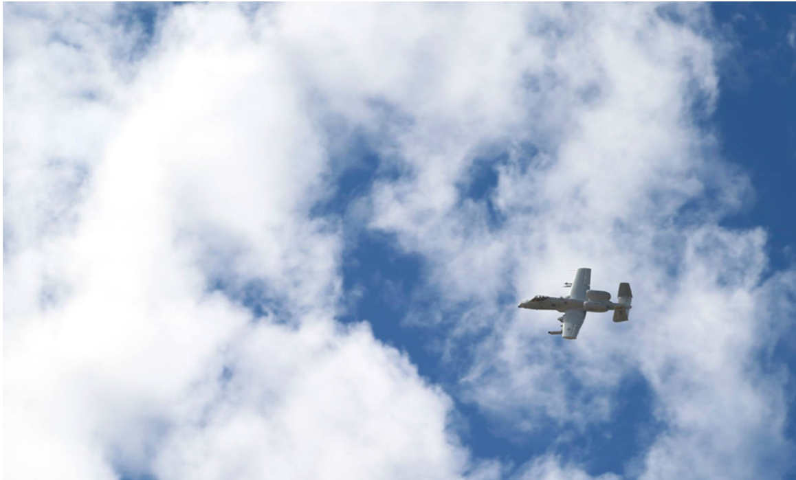
Left: An A-10 Thunderbolt supporting the 2nd Brigade Combat Team, 2nd Infantry Division, performs a flyover during Decisive Action Rotation 17-09 at the National Training Center in Fort Irwin, Calif., Sep. 13, 2017.

Here are the top photos from National Training Center Public Affairs professionals.