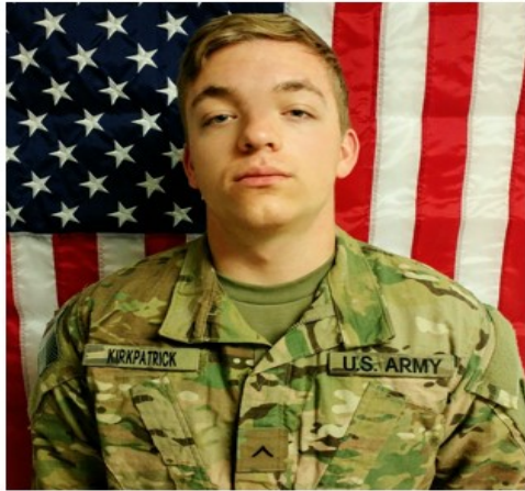
1 st Battalion, 36 th Infantry Regiment 1 st Stryker Brigade Combat Team (SBCT), 1AD 10 October 1997 – 03 July 2017