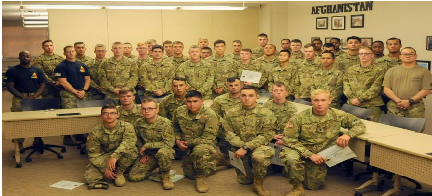
Ready First held it's 2nd Combatives (Level I) Course