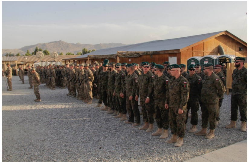
Attack Company, 4-17 IN held a Company level re-enlistment ceremony while forward deployed to Afghanistan