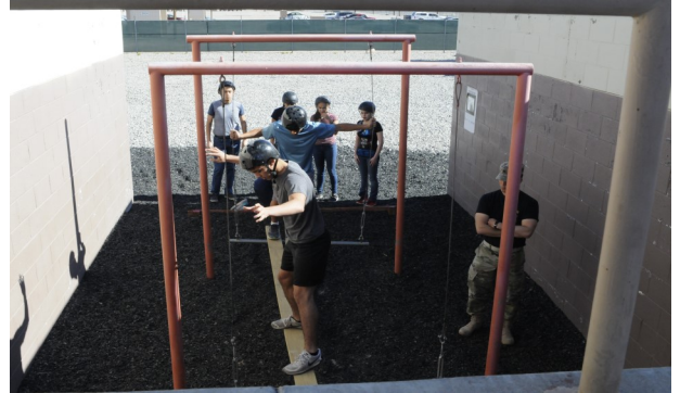
Ready First hosts students from Junior Leadership of El Paso