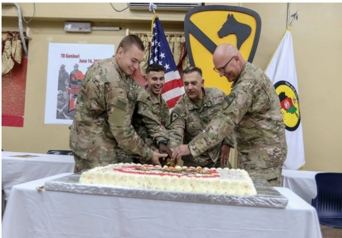
Ready First Brigade celebrated the Army's 242nd birthday today in Afghanistan with a cake cutting.