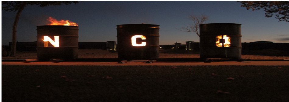
(The eternal flame of the NCO burns brightly in the night during the NCO Induction Ceremony May 10 2017.)

The tradition of the Induction ceremony is a passage used by senior NCOs to convey to newly promoted Sergeant’s the special pride, and sense of esteem associated with a young Soldier enters the NCO corps. The ceremony is a special celebration also honors all NCOs past and present who have served with pride and distinction.