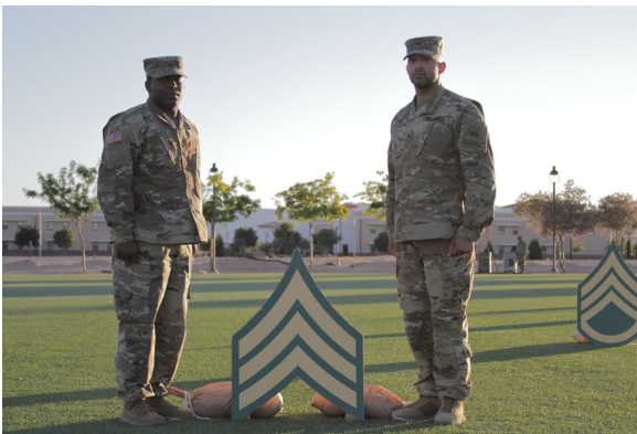
Soldiers from 16 th Engineer Battalion, 1 st Stryker Brigade Combat Team, 1 st Armored Division, are welcomed into the Corps of the Non Commissioned Officers at the NCO Induction Ceremony May 10 2017.