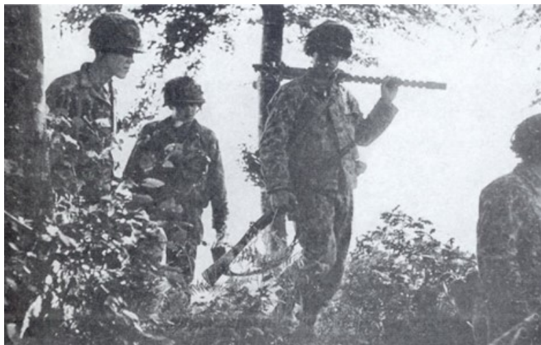
Left: Figure 3. 41st Infantry Normandy, France

3-41 IN transferred to Fort Hood, TX on 17 April 1991 and was inactivated on 15 June 1992. Following the September 11 th attacks 3-41 IN was reactivated in 2001 and served under the 3 rd Infantry Division. In 2007 the unit was formally reassigned to 1 st Armored Division, First Brigade Combat Team at Fort Bliss, Texas.