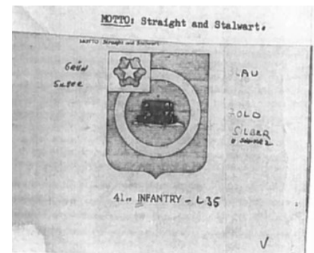
Figure 1. Original Design of Regimental Crest

ties between the HBT camo pattern and the uniform of the Waffen SS, the 41 st sustained minor friendly fire incidents during link up with the 101 st . The uniform was subsequently dropped by the time the unit reached Holland.