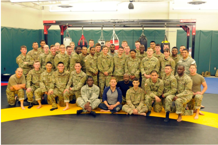
Ready First holds internal combatives course