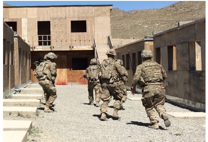
Blackfoot Troop, 6th Squadron, 1st Cavalry Regiment executed a Guardian Angel Team live fire exercise while supporting our forward deployed mission in Afghanistan.