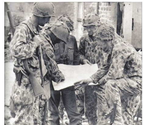
Figure 2. 41st Armored Infantry Regiment Carentan, France June 1944