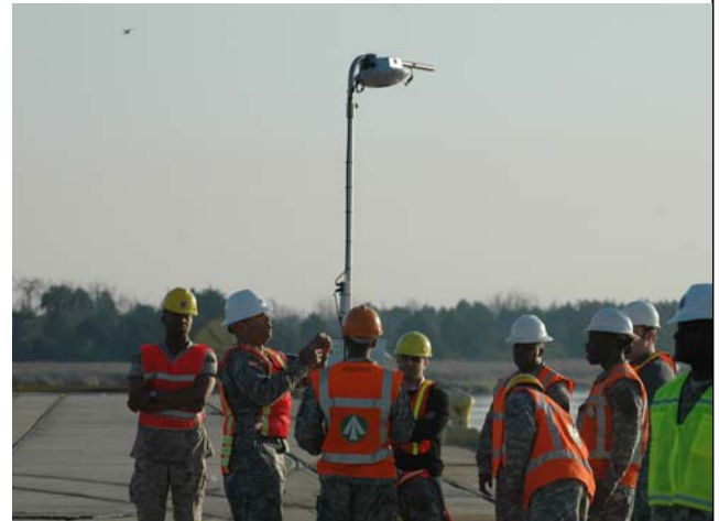
1174 th TTB sets up 841 st RF-ITV kit.