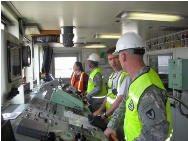
AMC CSM Mellinger visits SS El Faro crew.