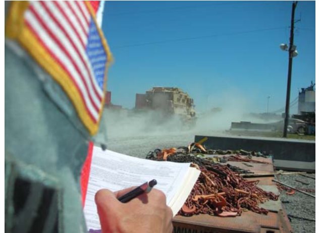
A SSG Jones (421 st TST) completes a cargo inspection.