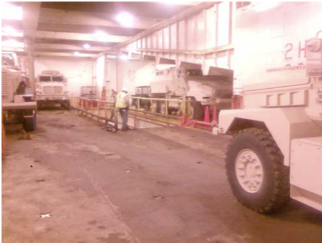
MRAPs staged near the ship elevator.