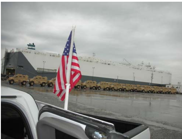
MRAPs staged for load on Alliance NY.