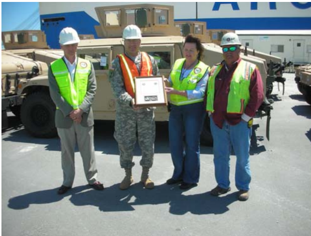
The 841 st and MTC are presented with award.