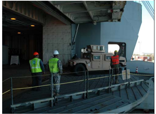
UAHs loaded onto a cargo ship in Charleston.

Hough intends to integrate force protection and security in all we do. This will be accomplished through force protection plans, and meetings. He brings port security experience from Kuwait and Sunnv Point.