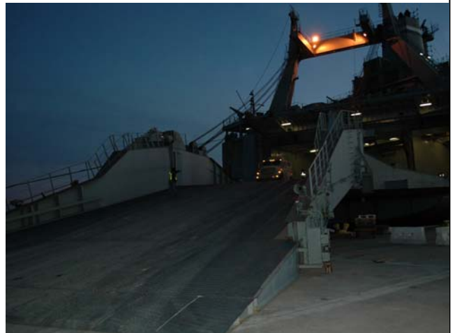
MRAPs staged on an MSC vessel.