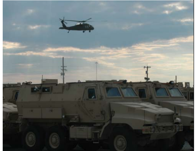
KFOR Black Hawk flies into Charleston seaport near staged MRAPs.