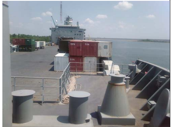
Military Sealift vessel loads Peru cargo.