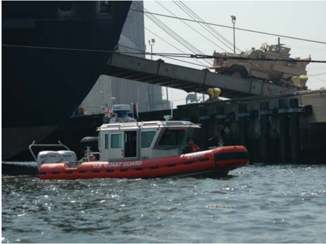
Charleston Coast Guard provides waterside security for army seaport Charleston OPS.