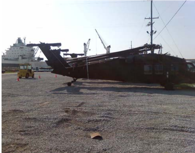
KFOR helicopters staged for sealift.