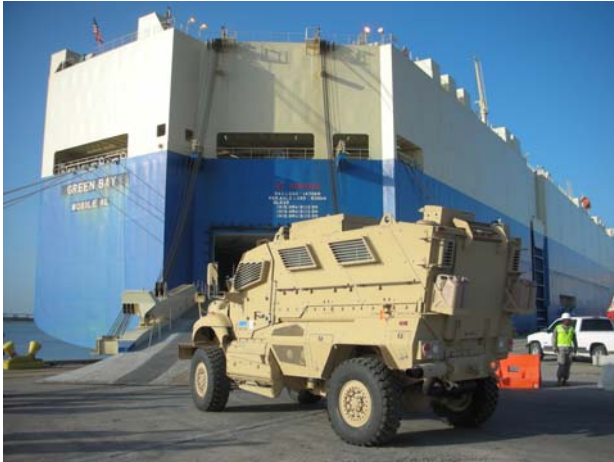
MRAP sealift onto commercial cargo vessel.