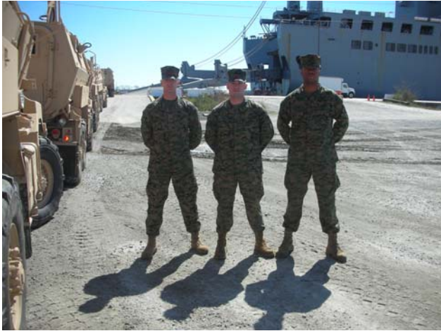
Savannah Marines (reserve) support 841 st OPS.