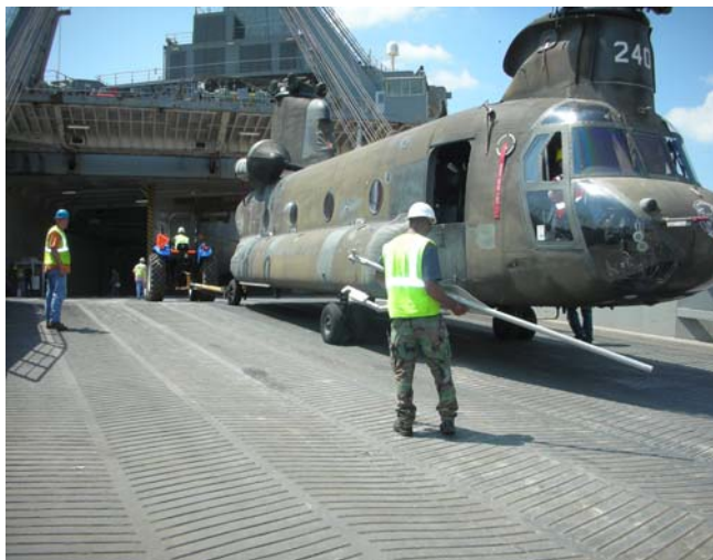
Humanitarian cargo headed to Peru loads.