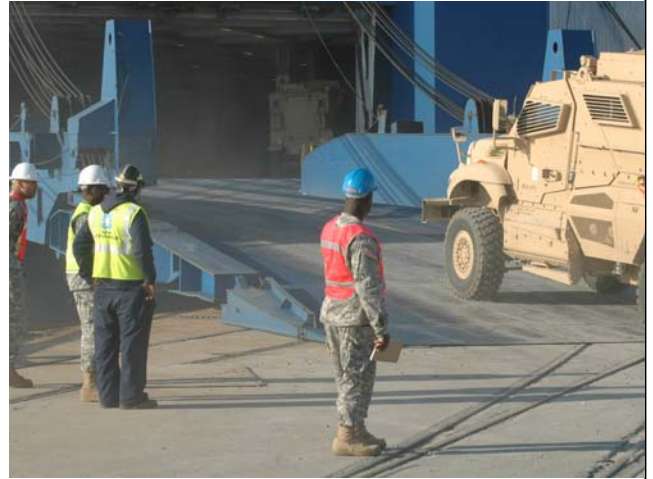
OIF MRAPs loaded onto commercial ship.

This partnership has been a win-win situation as it supports real-time missions and trains the marines for near-term future logistic port operations in Africa and Iraq.