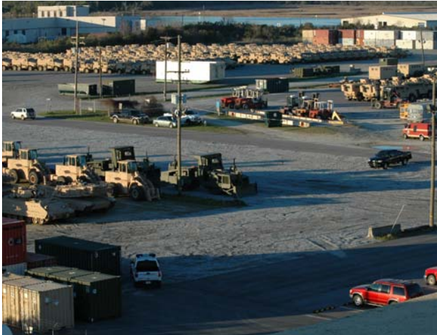
Aerial view of staging area Charleston.