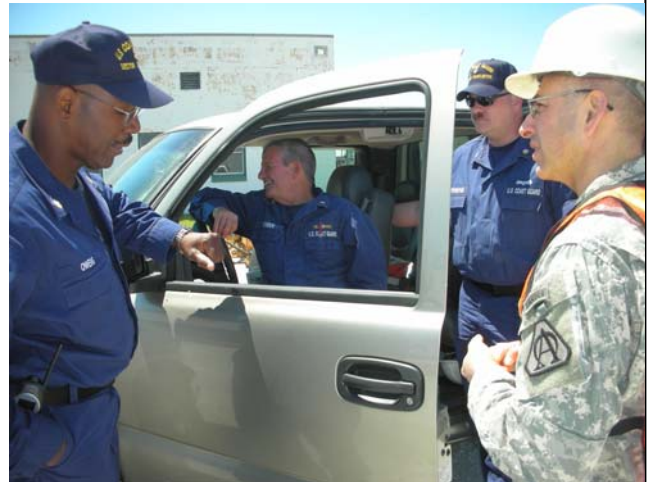
Charleston Coast Guard Petty Officers brief sealift container inspections.