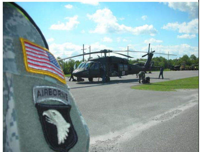
III. NG aviators disembark after landing in Charleston seaport.