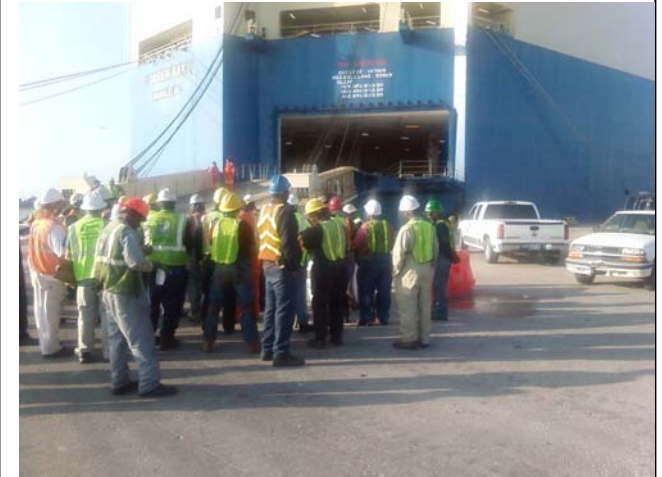
Marine Terminals Corp. longshoremen receive a safety brief prior to vessel load.

As the ceremony commenced, we were diligently providing waterside security and cargo oversight in the Strategic Port of Charleston. This ensures the military essential waterway was safe and secure for current and future MOL operations.