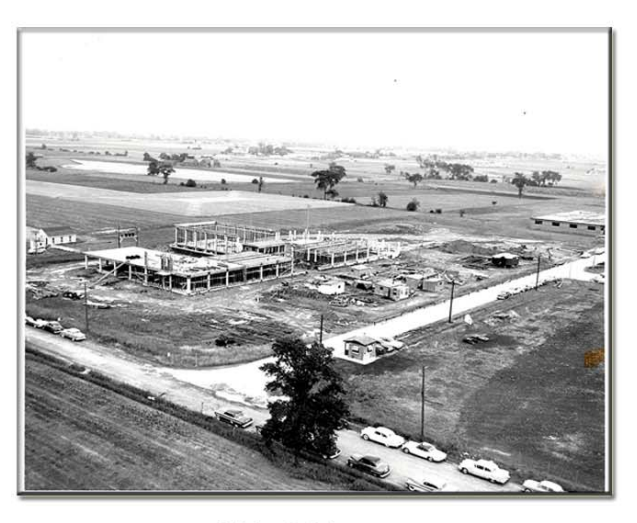
Bldg 901 1956