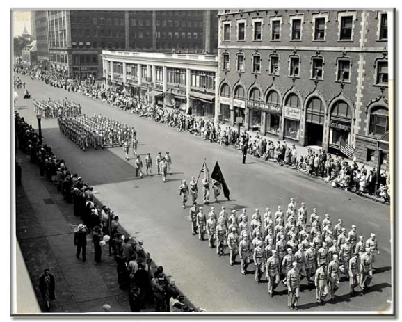
Memorial Day 1951