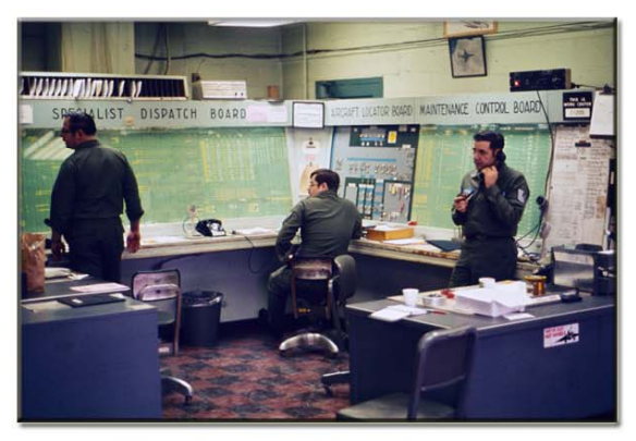
Maintenance Operation 1982