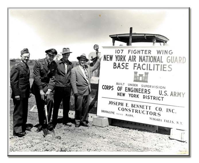
Ground Breaking 1954