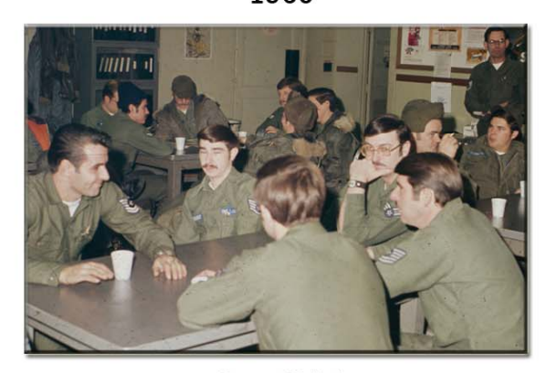
Crew Chiefs 1982