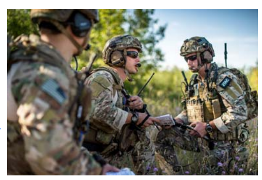
https:// www.facebook.com/27 4ASOS/