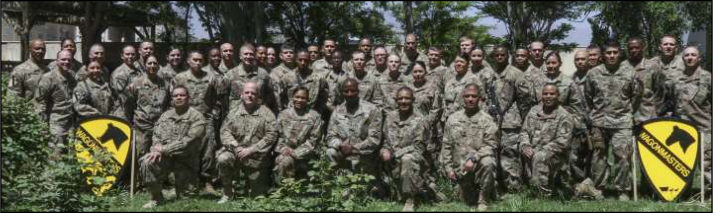
Attendees of the noncommissioned officer professional development working breakfast and discussion forum pose for a picture at Bagram Airfield, April 25.