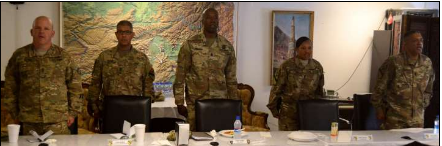
Sergeants Major recite "The Creed of the Noncommissioned Officer" to begin the noncommissioned officer professional development working breakfast and discussion forum at Bagram Airfield, April 25.