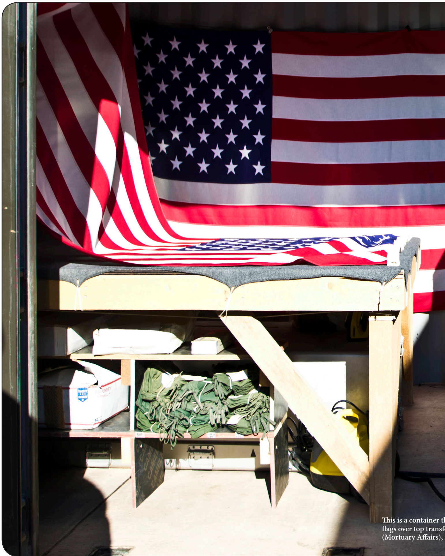
This is a container the flags over top transfi (Mortuary Affairs),