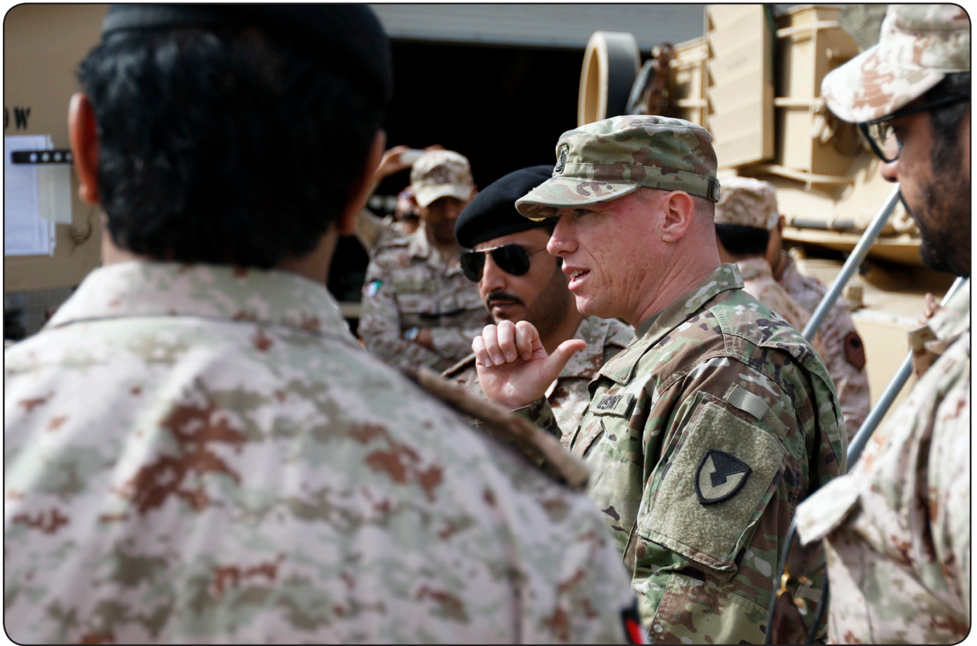
In an effort to increase a shared understanding of theater level logistics throughout the USCENTCOM area of operations, Kuwaiti Armed Forces and 1st Sustainment Command (Theater) logistics leadership met at Camp Arifjan, Kuwait.