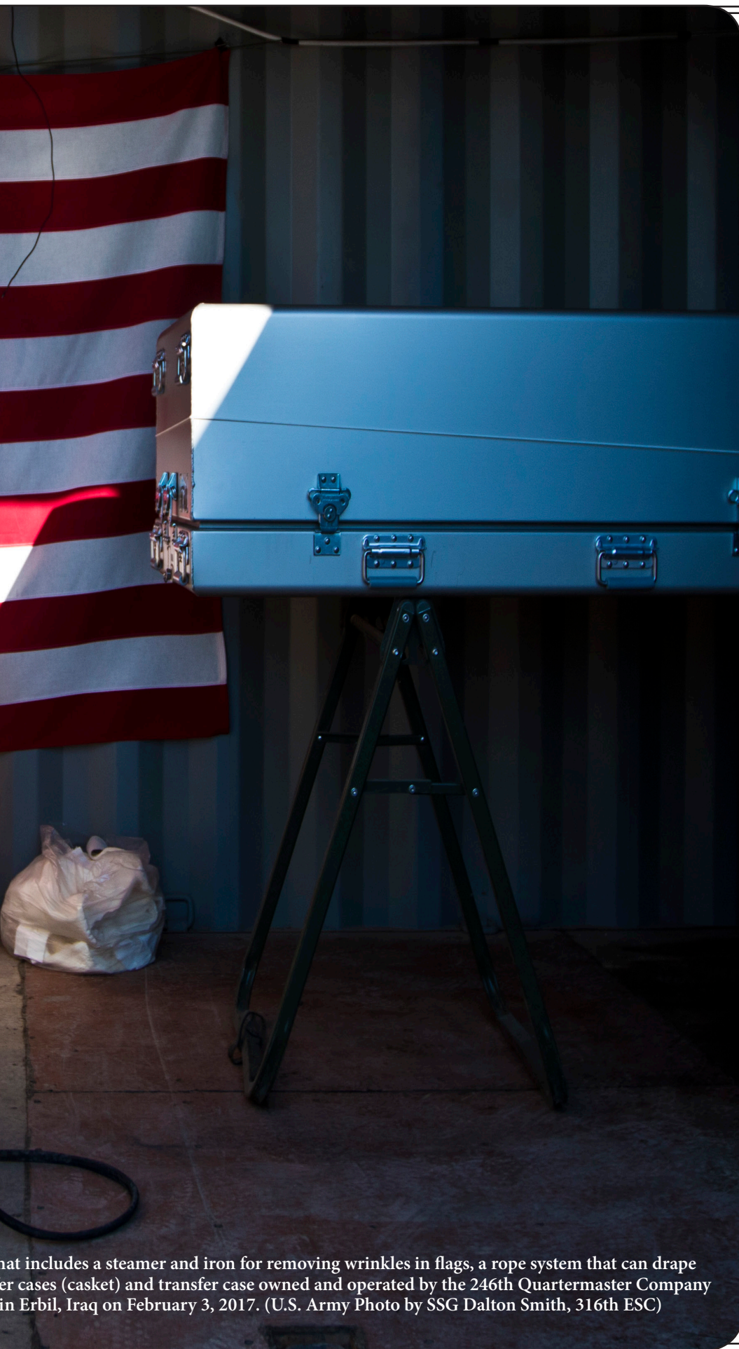
that includes a steamer and iron for removing wrinkles in flags, a rope system that can drape transfer cases (casket) and transfer case owned and operated by the 246th Quartermaster Company in Erbil, Iraq on February 3, 2017.

cases (casket) and of course, a transfer case.