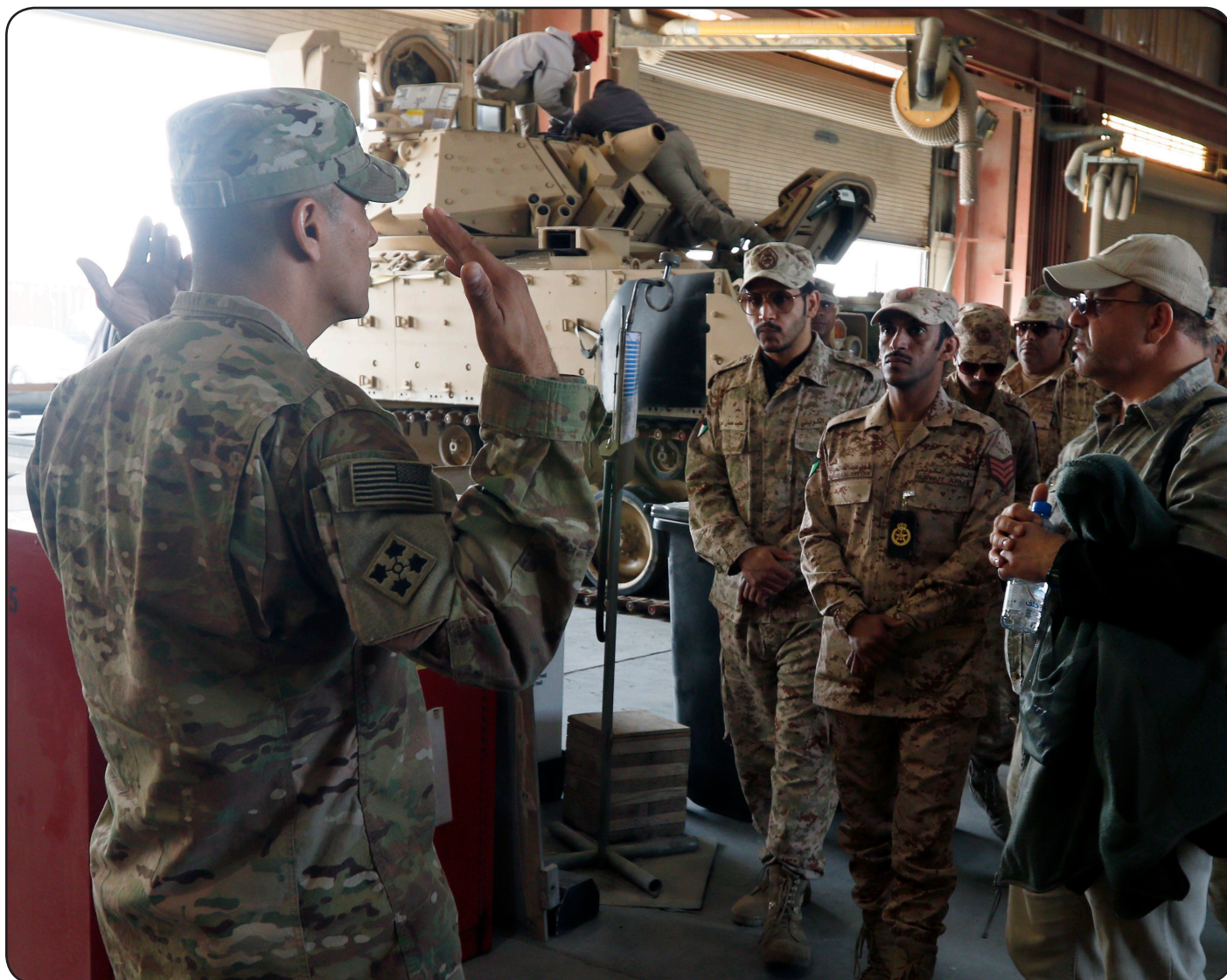
In an effort to increase a shared understanding of theater level logistics throughout the USCENTCOM area of operations, Kuwaiti Armed Forces and 1st Sustainment Command (Theater) logistics leadership met at Camp Arifjan, Kuwait.

discussion focused on operational level logistics staff processes, which enhance the bi-lateral military relationships between the armed forces.