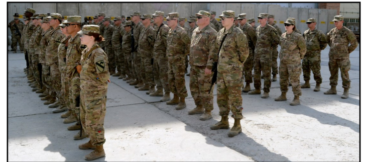
Soldiers of the 136th Combat Sustainment Support Battalion, 1st Cavalry Division Resolute Support Sustainment Brigade, stand at parade rest during the patching ceremony at Bagram Airfield, March 6.

670-1, Chapter 21, Paragraph 17, for their service conducting operations in Afghanistan, the Soldiers of the STB and all attached and subordinate units, are authorized to wear the 1st Cav. Div. shoulder sleeve insignia for wartime service.