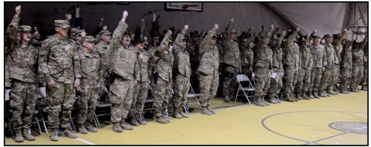
Soldiers sing the "Spirit of the Cav" at the Transfer of Authority Ceremony for the 185th Combat Sustainment Support Battalion (CSSB) and the 136th CSSB, at Bagram Airfield, Afghanistan, March 2.