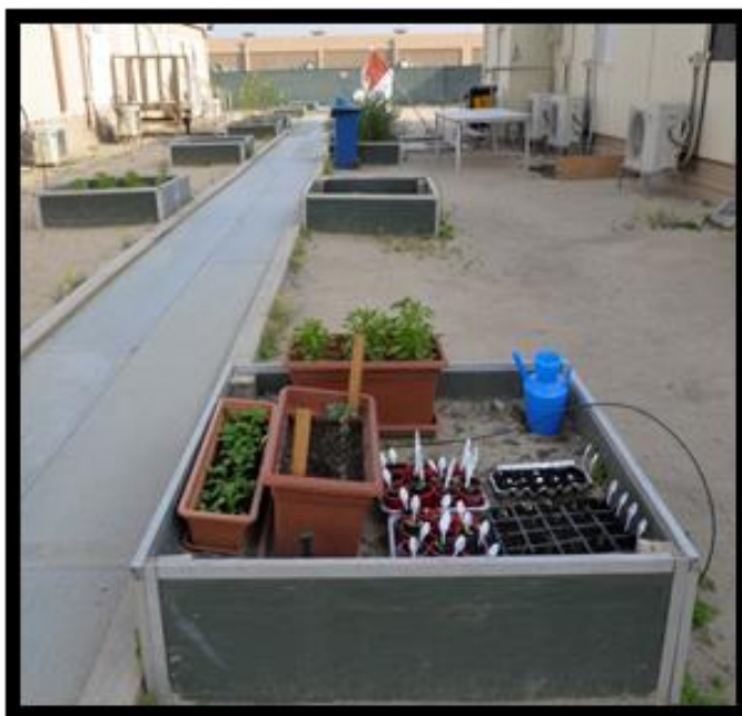
335 th Signal Command (T) (P) Soldiers' gardening skills

I encourage all Soldiers to push their chair away from the desk, go outside for fresh air and sunshine while at work. On their resiliency day emotional health, to find a time with family, see a movie, site seeing. Instead of finding work, find a reason to life at this very moment.