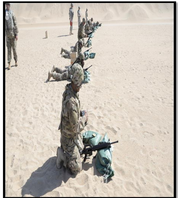
Soldiers from the 335 th Signal Command (T) (P) during M1620 qualification range on 14 February 2017 at Udairi Range Complex at Camp Buehring, Kuwait.