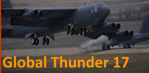
Published November 2, 2016

https://www.dvidshub.net/news/193724/arcog-soldier-wins-information-systems-security-associations-annual-volunteer-award