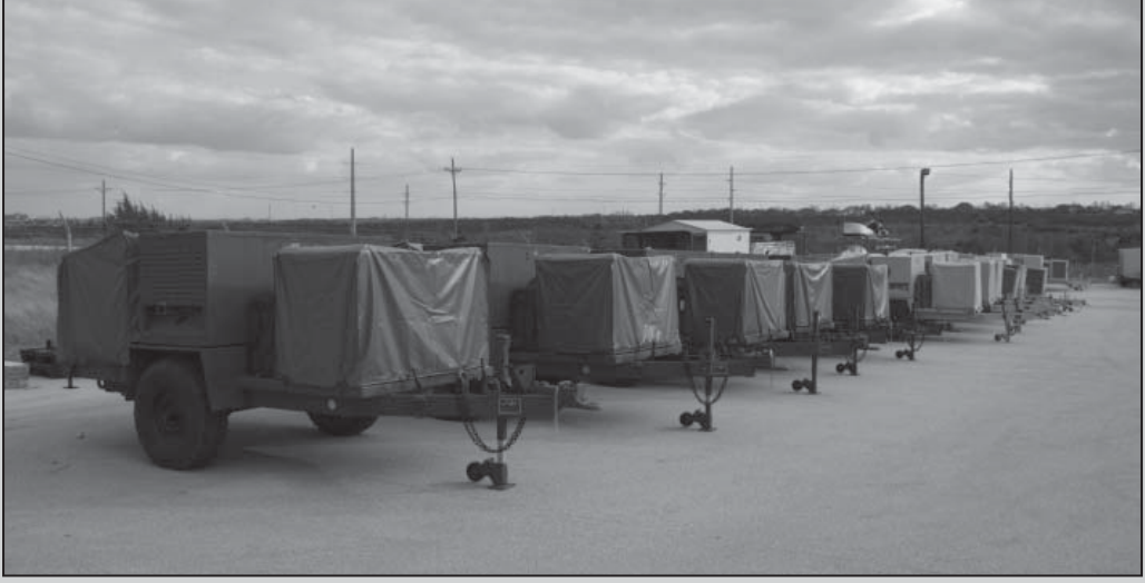
Section personnel repaired five medium TMSS last month that were fielded to the 405th Army Field Support Brigade in Eygelshoven, Netherlands.

"Our mission is and will always be supporting the Warfighter to the best of our abilities by providing highquality products in a timely manner."