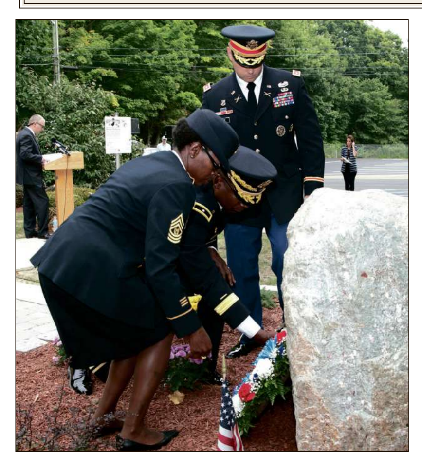
A 21-gun salute with three howitzers was part of a wreath ceremony here on Sept. 9 in remembrance of the Sept. 11, 2001, terror attacks. Marines from Gulf Company, 2nd Battalion, 25th Marine Regiment, fired blank rounds. The ceremony was at the Visitor Center because of a 9/11 memorial marker that is located there.