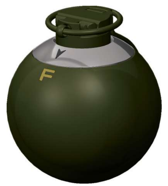
The first new lethal hand grenade in more than 40 years is designed to give greater flexibility to the warfighter.