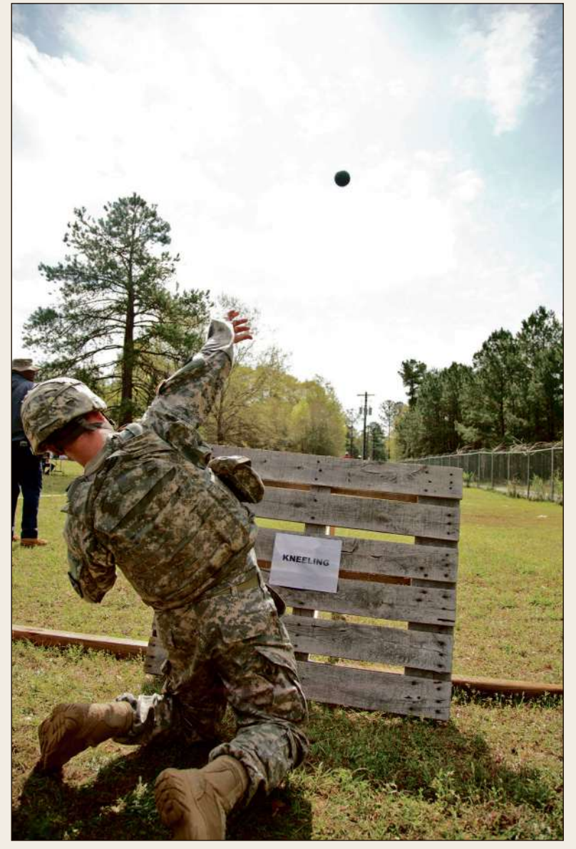
A Soldier at Fort. Benning throws a prototype, inert grenade from the kneeling position.