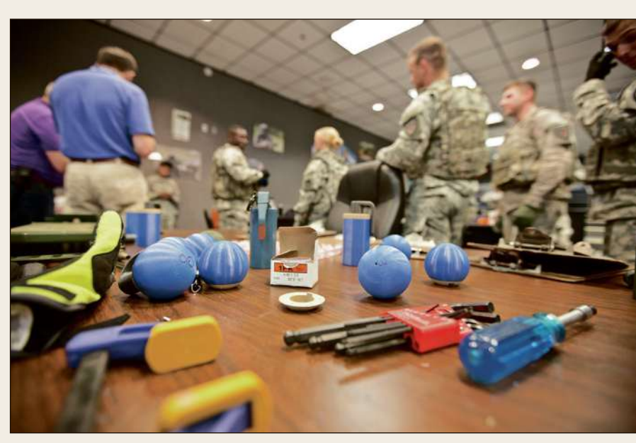
Soldiers, Marines and engineers gather to evaluate and down-select various grenade body and arming designs.