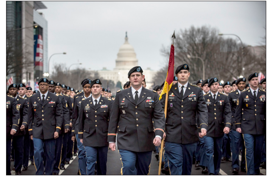
Above U.S. Army Reserve Soldiers from the 3rd Transportation Brigade (Expeditionary) march during the 58th Presidential Inauguration Parade in Washington, D.C., Jan. 20, 2017.

Left Troopers from 1st Squadron, 11th Armored Cavalry Regiment, prepare to defend the National Training Center (NTC) 'City of Ujen' during phase 1 of NTC rotation 17-03, Jan. 15, 2017.