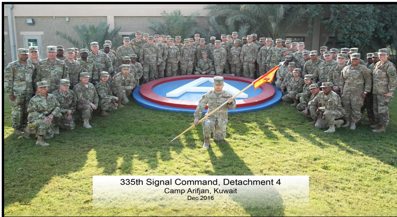
335th Signal Command, Detachment 4 Camp Arifjan, Kuwait Dec 2016