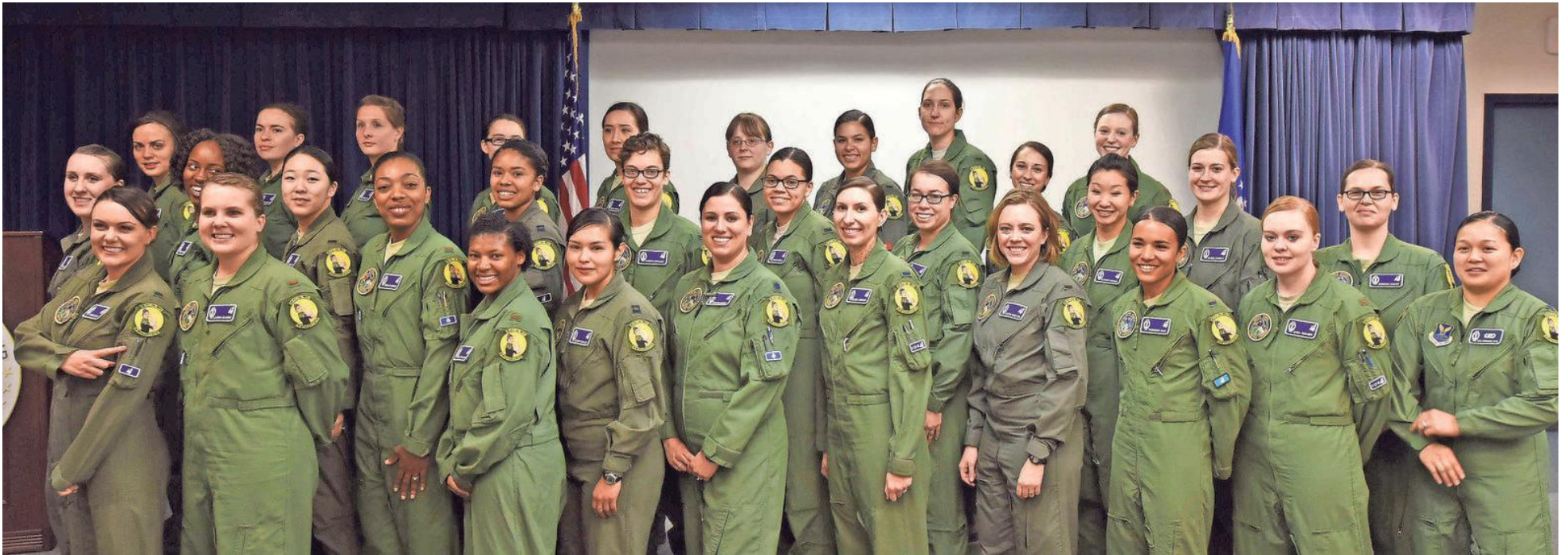
An all-female alert missile crew from Malmstrom Air Force Base after a pre-departure briefing at the base in March.