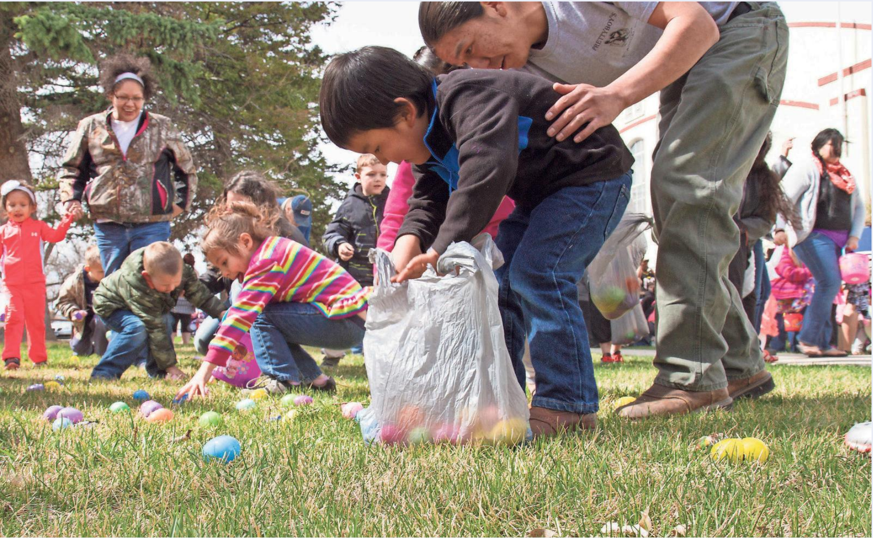
Toddlers and pre-school-age kids race to fill their baskets and bags with eggs on the lawn outside the Trades and Industries Building at Montana ExpoPark during last year's Great Falls Rescue Mission Easter Egg Hunt. More than 500 kids are expected at this year's hunt, for kids 12 and younger, at 11:30 a.m. Friday, March 25.