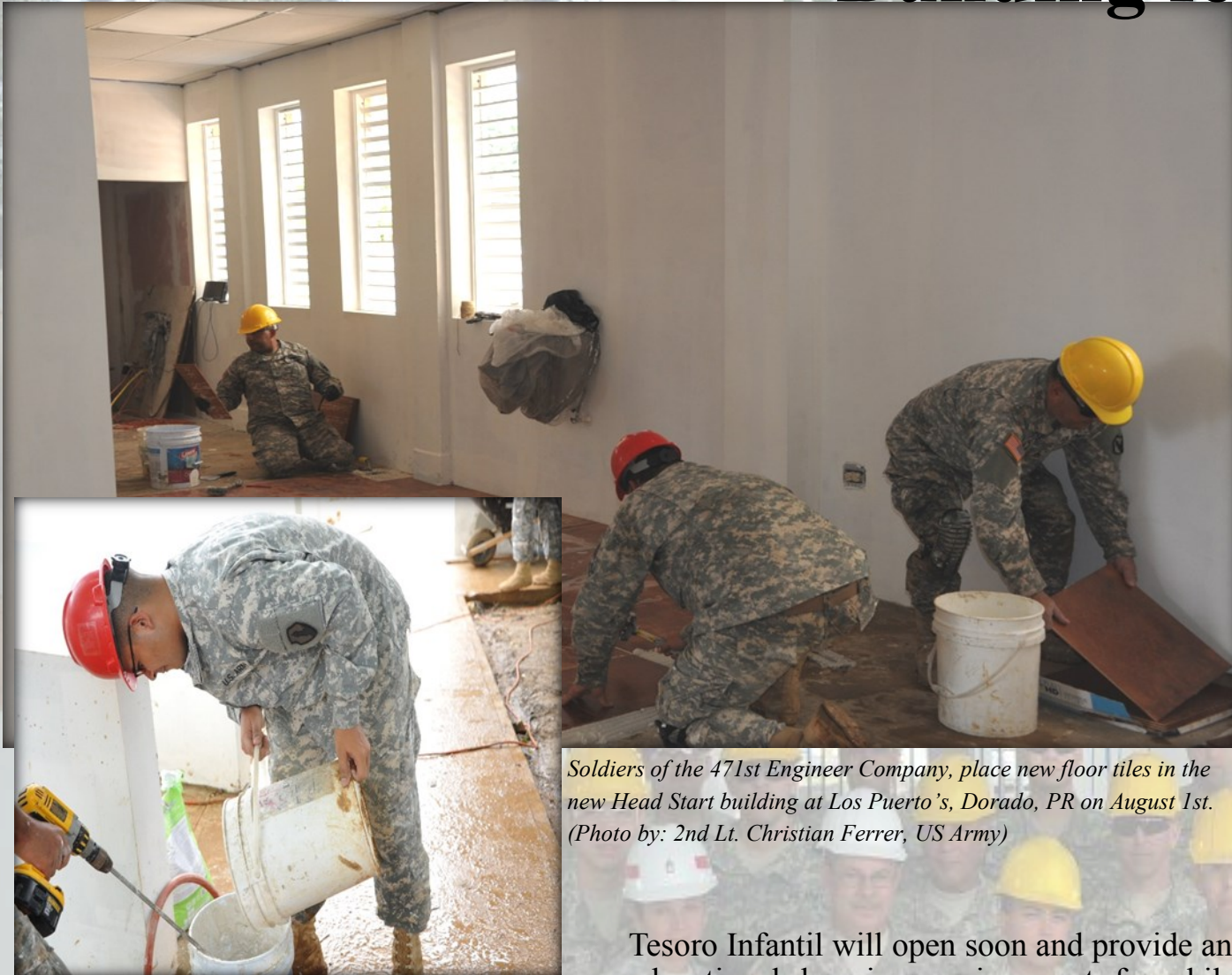
Soldiers of the 471st Engineer Company, place new floor tiles in the new Head Start building at Los Puerto's, Dorado, PR on August 1st.

DORADO, Puerto Rico - Army Reserve Soldiers from the 471st Engineer Company (Vertical) and the 756 th Engineer Company assisted in the remodeling a former elementary school into a new Head Start Facility, "Tesoro Infantil", June 20 – 3 August. The 471 st demonstrated their support and dedication to local communities by helping with this project that benefits the citizens of Los Puerto's Sector in the Higuillar Ward of Dorado.