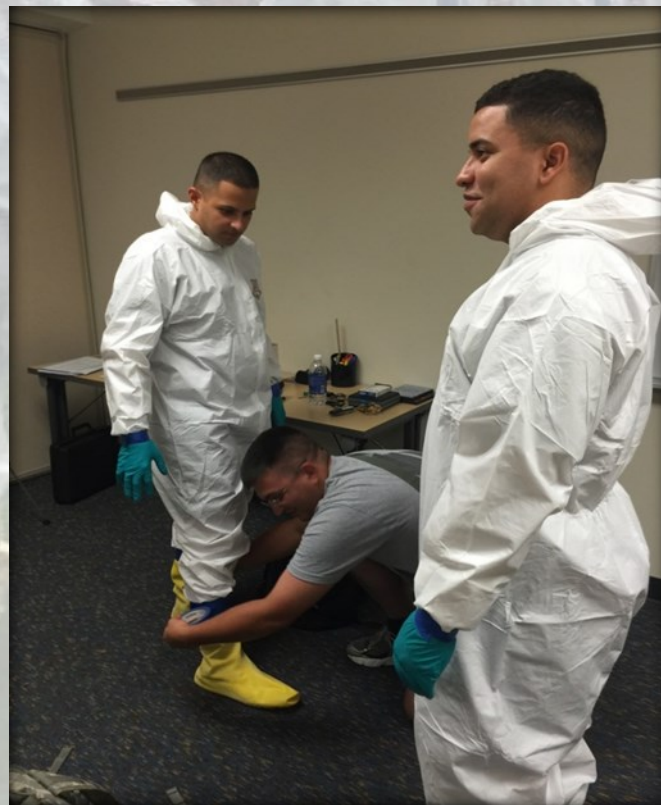
Soldiers from the 1st Mission Support Command train with chemical suits in order to enhance their performance during a real life scenario, Fort Buchanan, PR on June 9th.

The Occupational Safety and Health Administration (OSHA) Disaster Site Worker