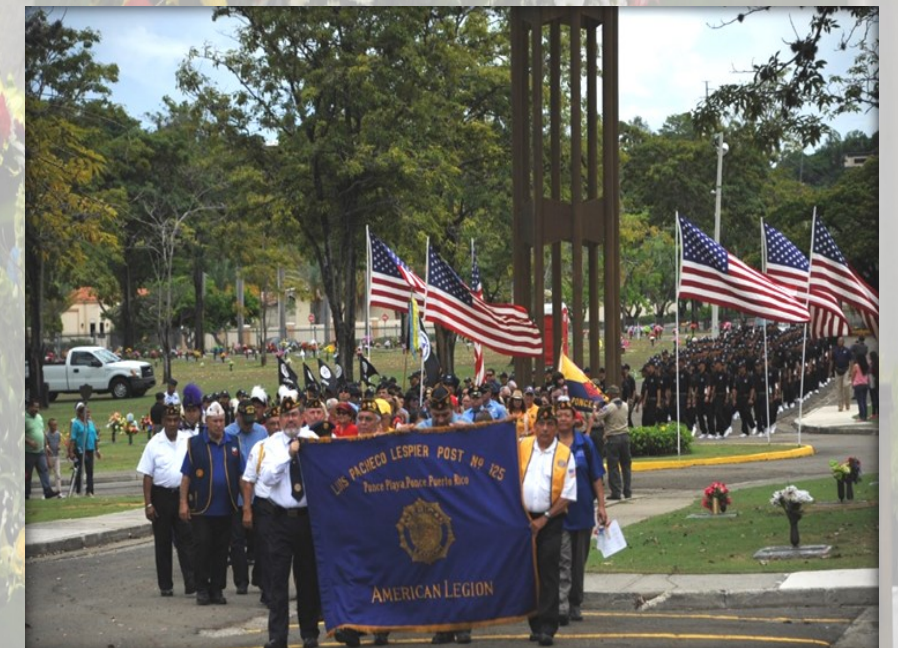
Retired Veterans, First Responders, Armed Forces, and Family members march along to honor the fallen heroes during the Memorial Day event at Las Mercedes National Park on May 30th.

During this solemn event, approximately seventeen different groups marched alongside each other. Veteran organizations, community members, family, friends and military members gathered to pay their respects for those that have given the ultimate sacrifice.