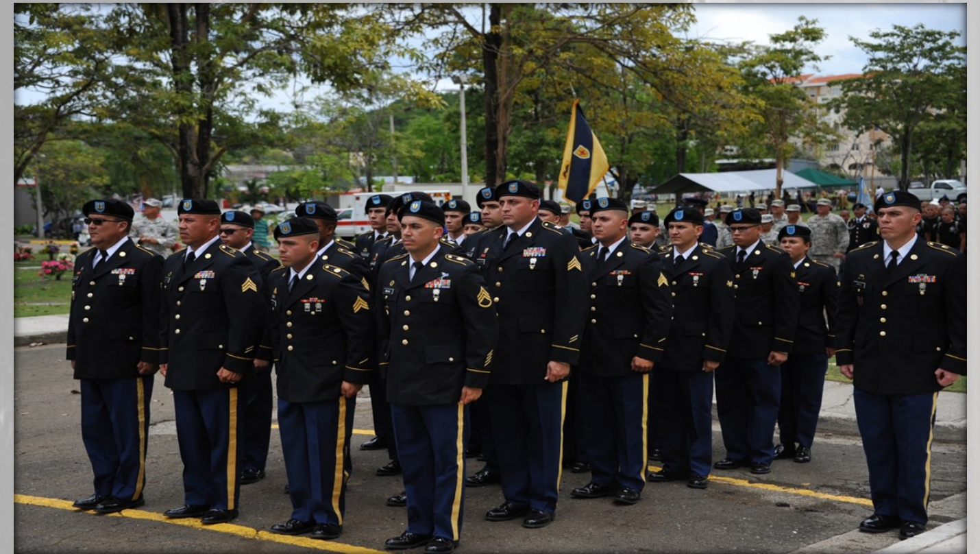
U.S. Army Reserve Soldiers from the 1st Mission Support Command, participate in a Memorial Day event at Las Mercedes National Park, PR on May 30th.

Ponce PR – U.S. Army Reserve Soldiers from the 1st Mission Support Command, participated in a Memorial Day march at Las Mercedes National Park on May 30th.