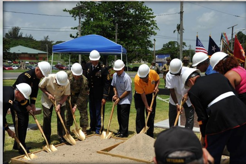
Veterans along with U.S. Army Garrison and 1st MSC leadership inaugurate the new Fort Buchanan Memorial Park, PR on June 14th.

FORT BUCHANAN, Puerto Rico - Multiple ceremonies took place on June 14, the Army's 241st birthday. The Memorial Park Groundbreaking Ceremony was one of them, where many veterans from the Vietnam War, World War II, Korean War, Desert Storm, Operation Iraqi Freedom and Enduring Freedom, participated along with their Families. The US Army Garrison and 1st Mission Support Command leadership also joined to recognize our war heroes who lived to tell their stories and those who made the ultimate sacrifice.