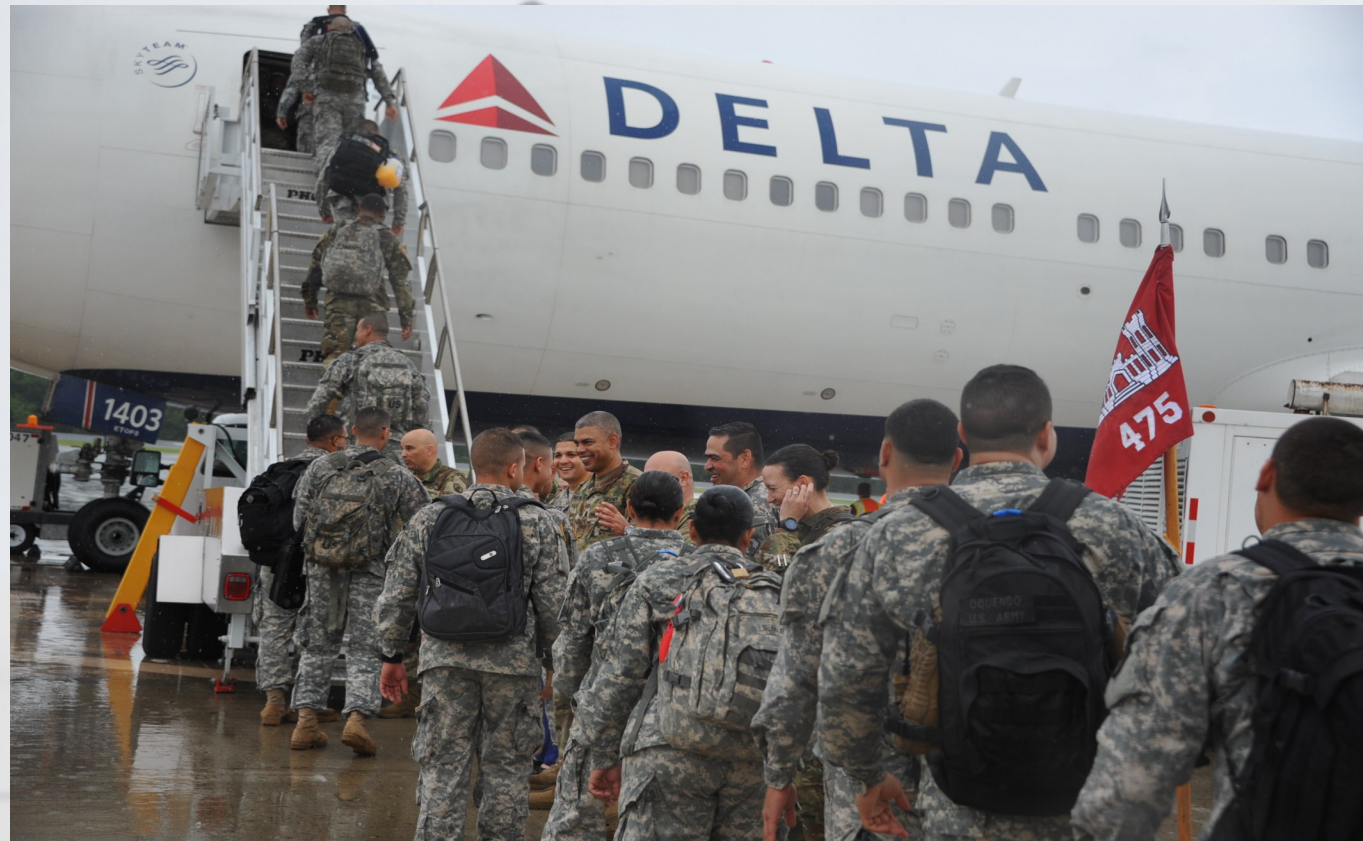
Soldiers of the 475th Engineer Company say their last good-bye and shake the hand of the 1st Mission Support Command leadership prior to boarding their plane and heading to their mobilization station in Texas, on June 2nd.

Friends and family bid farewell to the 475th Engineer Company during a departure ceremony on May 28, at Juana Diaz, Puerto Rico.