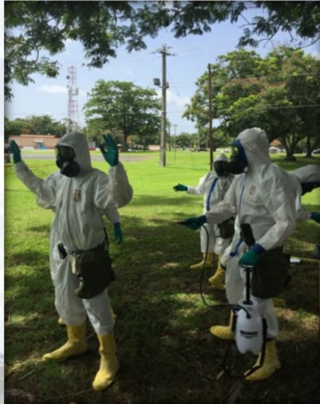
Soldiers from the 1st Mission Support Command train with chemical suits in order to enhance their performance during a real life scenario, Fort Buchanan, PR on June 9th.

Outreach Training Program is for Disaster Site Workers who provide skilled support services, (e.g. demolition, debris removal, or heavy equipment) or site clean-up services in response to natural or man-made disasters. The pre-incident training is essential for ensuring disaster worker safety and health are priority when in support of any DSCA operations in any part of Puerto Rico and US Virgin Islands (USVI).