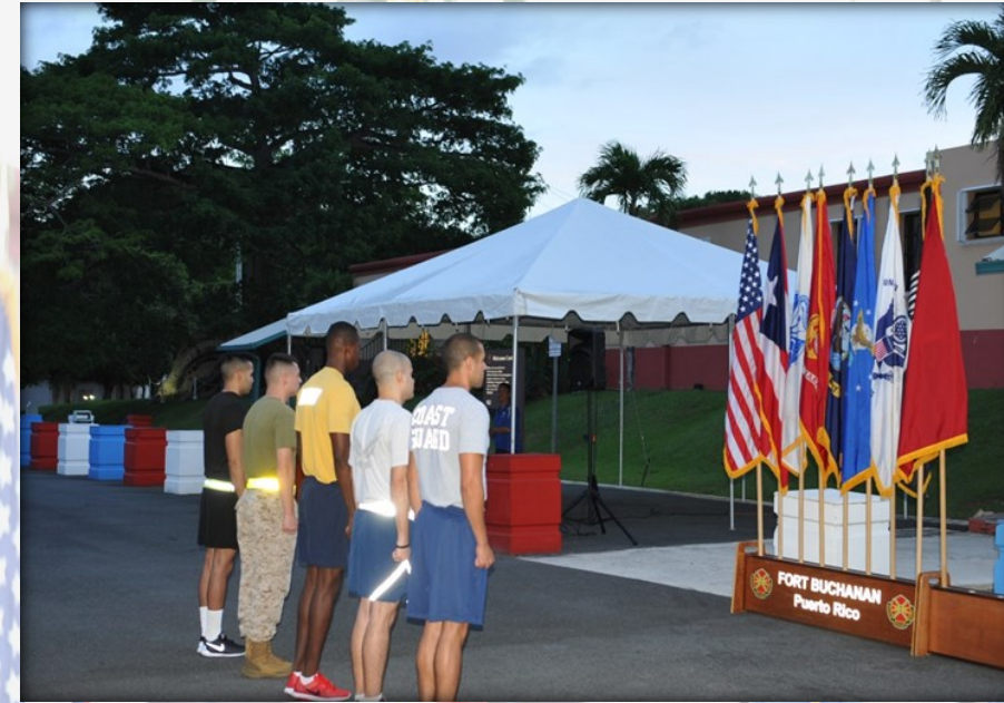
Representatives from the U.S. Army, U.S. Marine Corps, U.S. Navy, U.S. Air Force, and U.S. Coast Guard stand at attention before retrieving their respective branch guidon prior to the Armed Forces Day run at Fort Buchanan, PR on June 14th.

FORT BUCHANAN, Puerto Rico - U.S. Army Reserve, Marine Corps, Air Force, Coast Guard, and Navy Soldiers ran together during Armed Forces Day, on June 14, 2016.