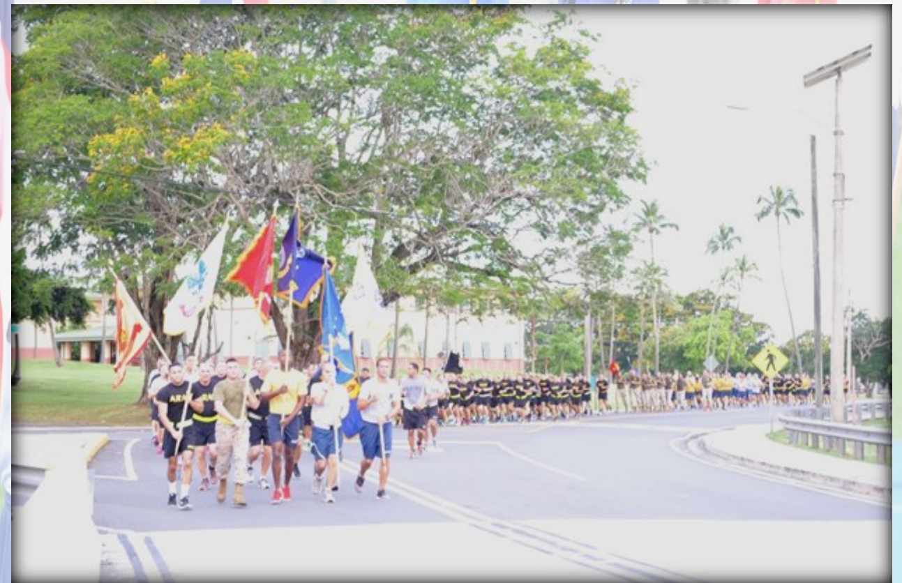
Service members participate in an Armed Forces Day formation run at Fort Buchanan, PR on June 14th.

This was a great opportunity for the various military members to learn from each other and build comradery.