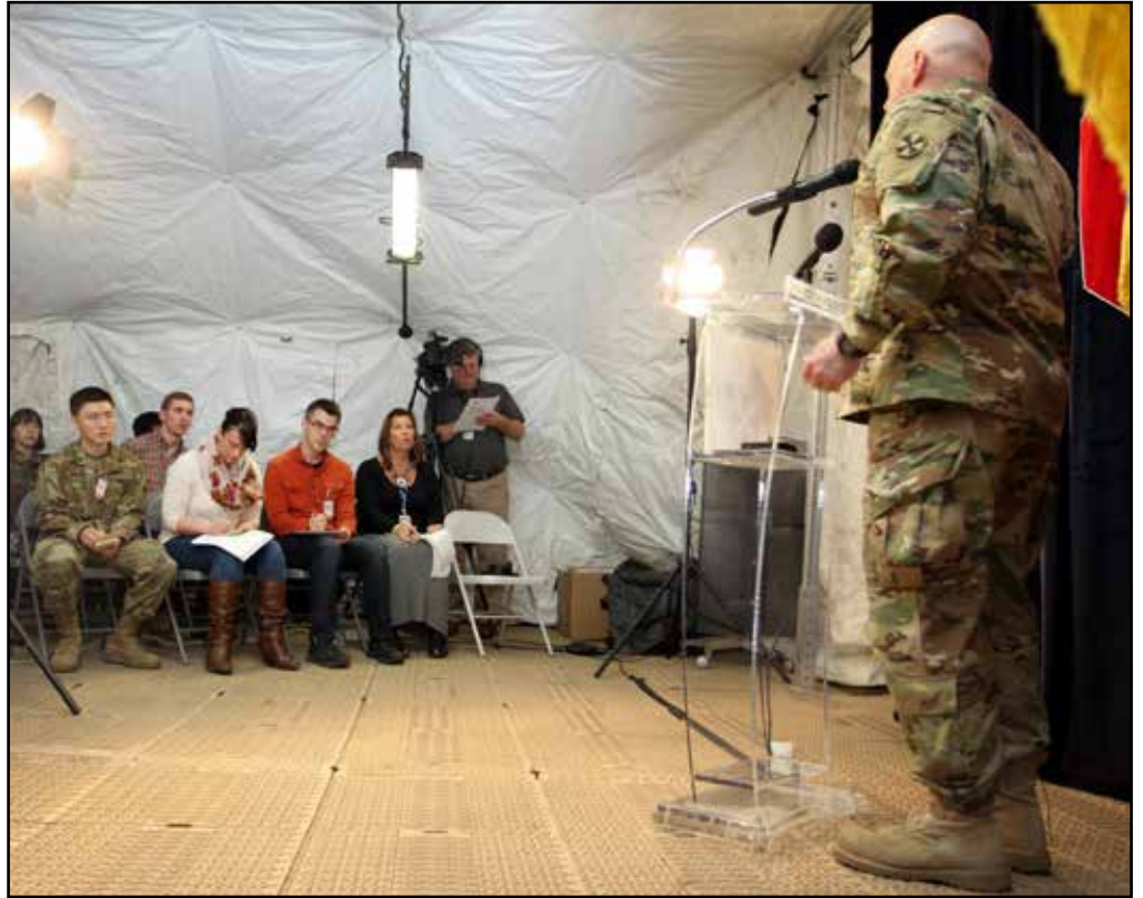
Notional press conference participants practice their skills by both acting as reporters and hosting other notional media at the 109th MPAD's notional press conference, Yongsan Garrison, March 16.

“On weekend drills we don’t always have enough time in our training calendars to train for missions we would perform in wartime scenarios because we