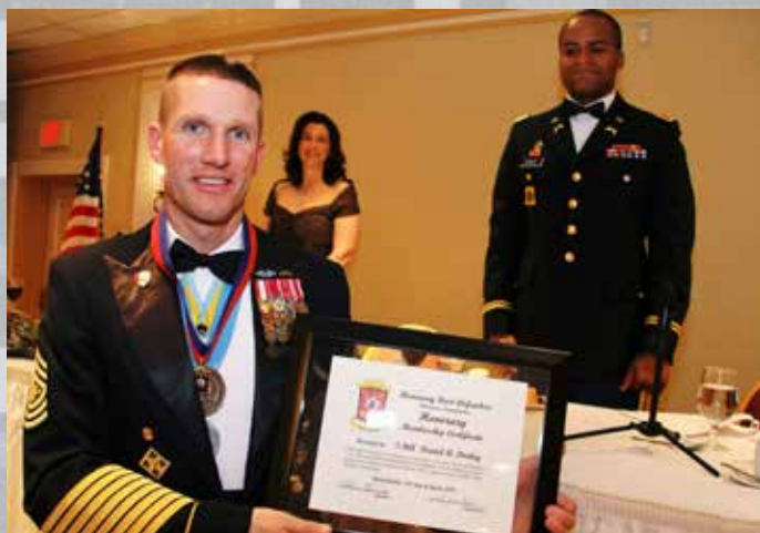
Sgt. Maj. of the Army Daniel A. Dailey displays his honorary membership certificate for the Honorary First Defenders.