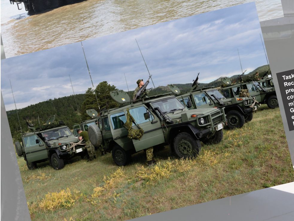
Task Force 41 Armoured Reconnaissance Squadron preps vehicles prior to conducting their daily missions during the 2016 Golden Coyote training exercise.