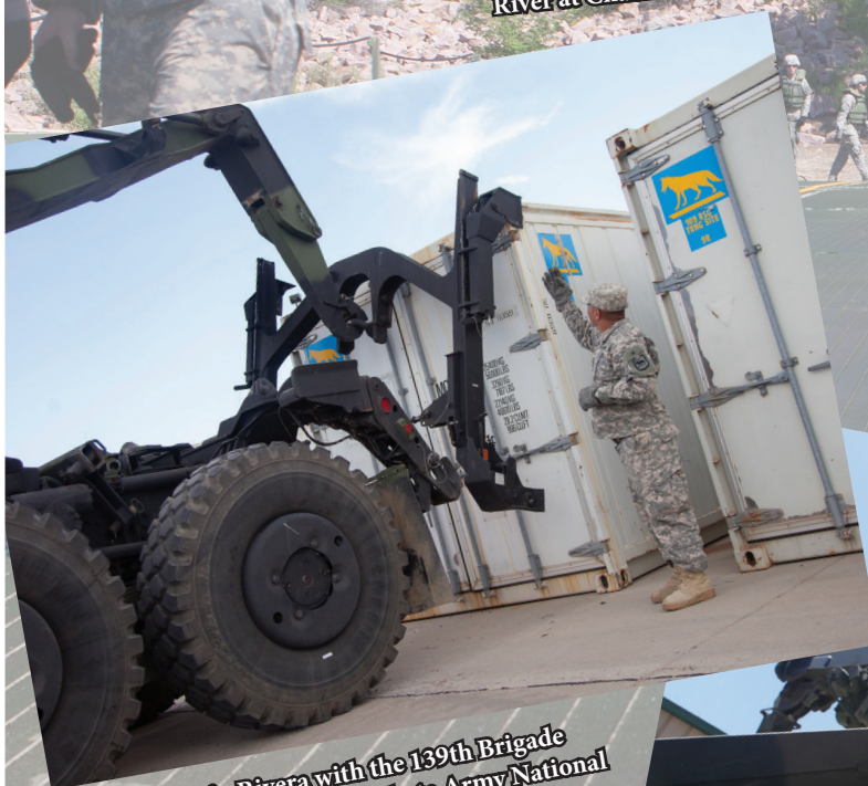
U.S. Army Pfc. Rivera with the 139th Brigade Support Battalion, South Dakota Army National Guard, ground guides a Palletized Loading System vehicle during training in support of Golden Coyote exercise, Camp Rapid, S.D. June 9.