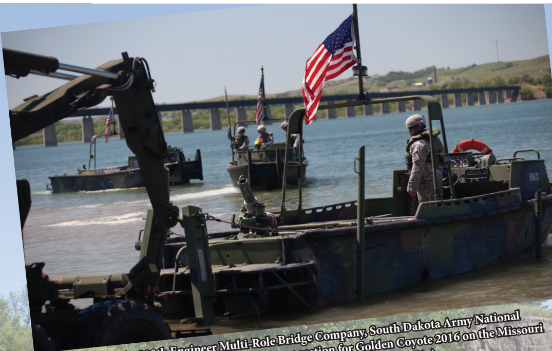
U.S. Soldiers of the 200th Engineer Multi-Role Bridge Company, South Dakota Army National Guard, operate M12 Bridge Erection Boats in preparation for Golden Coyote 2016 on the Missouri River at Chamberlain, S.D., June 10.