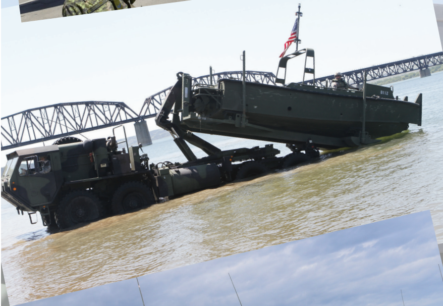
U.S. Army Soldiers with the 200th Engineer Multi-Role Bridge Company, South Dakota Army National Guard, unload a Mk2 Bridge Erection Boat into the Missouri River in support of Operation Golden Coyote, Chamberlain, S.D., June 10.