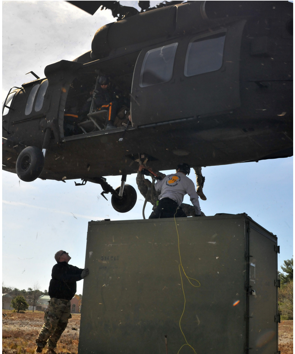
Members of 1-150th Assault Helicopter Battalion, Jersey Army Army National Guard, and the New Jersey State Police connect a sling loaded search and rescue gear container to a Black Hawk helicopter as part of a New Jersey Task Force 1 exercise.

"We try to be diligent as well as honest with our capabilities," he said. "We try to prove that we are who we say we are. We are never satisfied, because the next