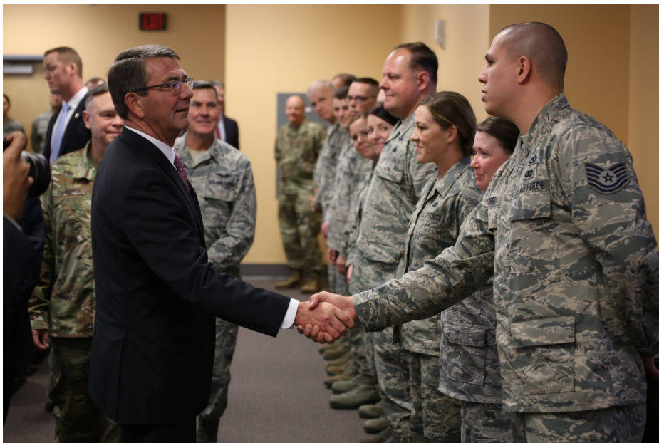
Secretary of Defense Ashton Carter shakes hands with airmen during a visit to the 262nd Network Warfare Squadron at Joint Base Lewis-McChord on March 4. Carter highlighted the role of cyber operations in national defense.