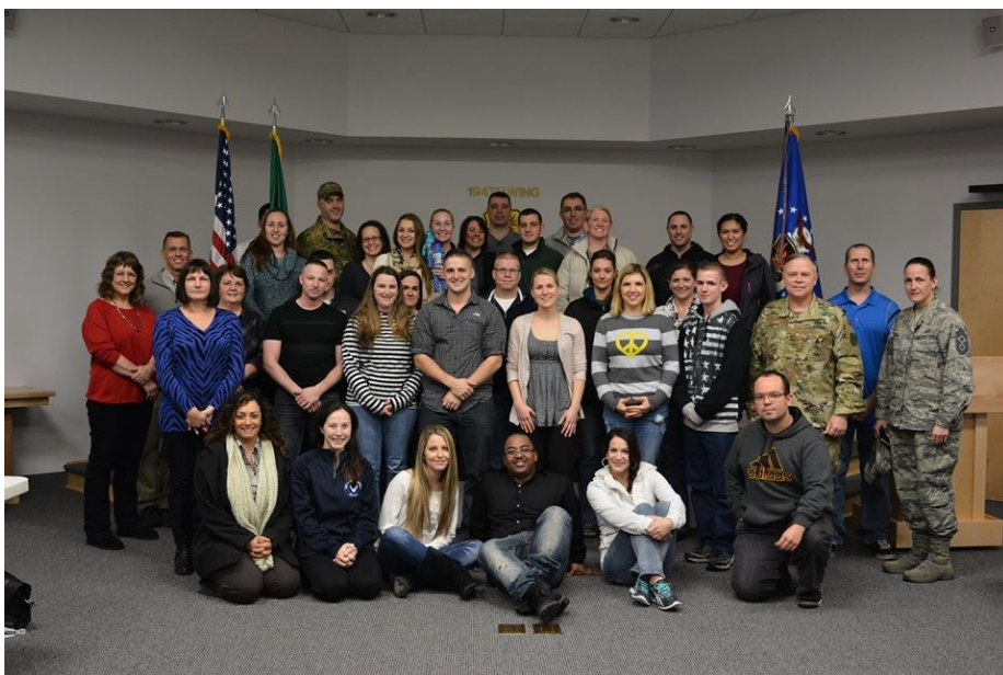
ABOVE AND BELOW: Participants in the Peer to Peer Training program meet for training in January

meet quarterly with Lynn MacKinnon for ongoing training and consultation. A big thank you to the trainees, trainers, and the leadership who contributed to the success.