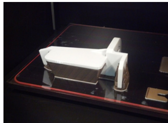
A plastic thermal spray gun mount is created in the 3D Fortus printer. The part holds the spray gun used to apply protective metal coatings on front and rear aircraft engine casings.

According to Allen, the new AM spray gun mount enables the shop to continue providing quality service to the fleet. "The part is working beautifully and is saving us a lot of money in spray gun extension replacements," he said. "It has definitely been a great collaborative effort."