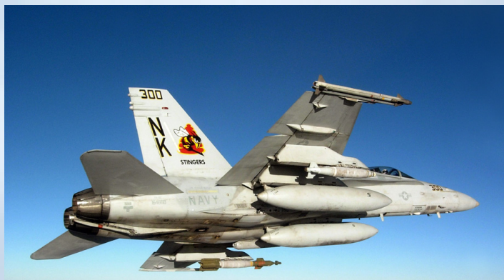
An F/A-18C Hornet assigned to the VFA-113 Stingers flies over southern Afghanistan in 2009 during Operation Enduring Freedom.