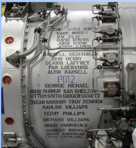
A J52 engine displays names of the ‘crew members’ who made the program a success. The J52 engine program officially came to a close Feb. 4.