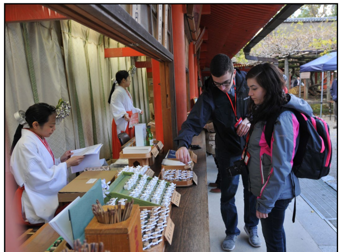
Left: Service members from I Corps and the Middle Army raise their respective Nation's flags on Camp Itami, Japan. Right: Soldiers from I Corps visit a temple in Nara, Japan during a sponsored cultural tour.