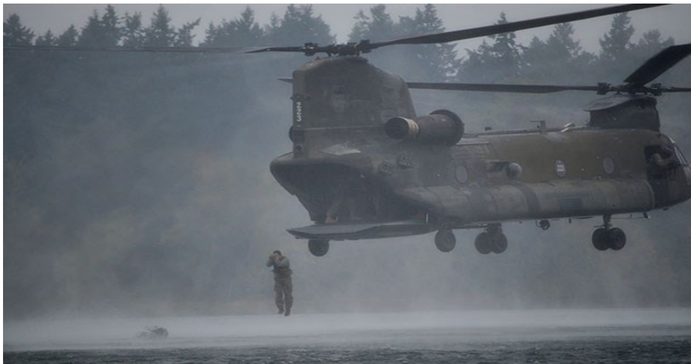
571st Sapper Company conducts helocast into American Lake!