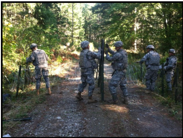
FIDO 2/1 emplacing 11-Row anti-vehicular wire obstacle