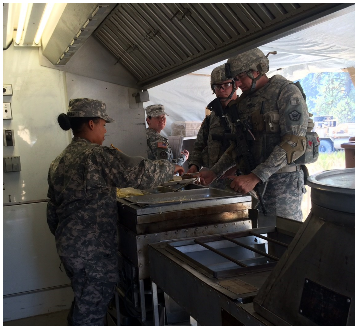
The FSC Field Feeding Section cooks up 5-Star meals in the field in the Containerized Kitchen.