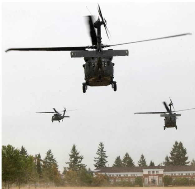
571st Sapper Company conducts Air Assault Missions in Blackhawks!