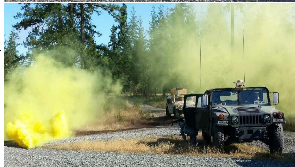
Soldiers of the Headquarters and Headquarters Company conduct combat patrol rehearsals