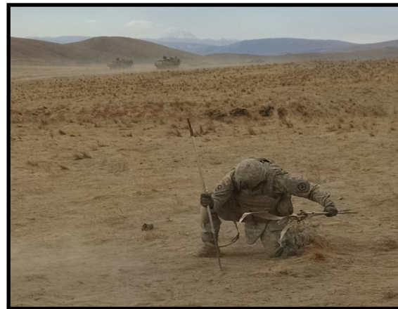
FIDO Soldier marking the breach during a LFX with 2-2 IN