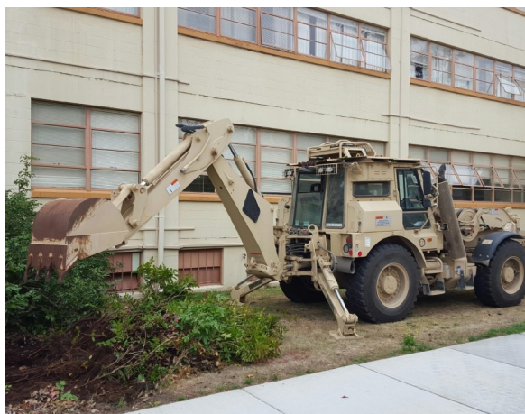
SPC Limbu and members of the Equipment Platoon operating the HMMWV during basic construction operations in support of 16th CAB.