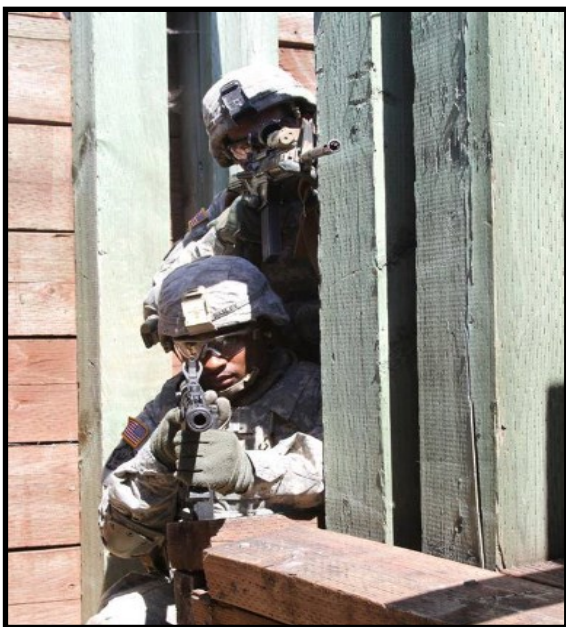
Soldiers of 2PLT conducting trench clearing LFX.