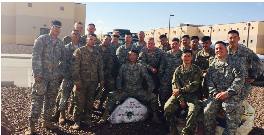
Members from 1st Platoon “Misfits” traveled to Fort Bliss, TX for a 30 day field rotation to support 2/1 ABCT during the Network Integration Evaluation (NIE) 16.1.