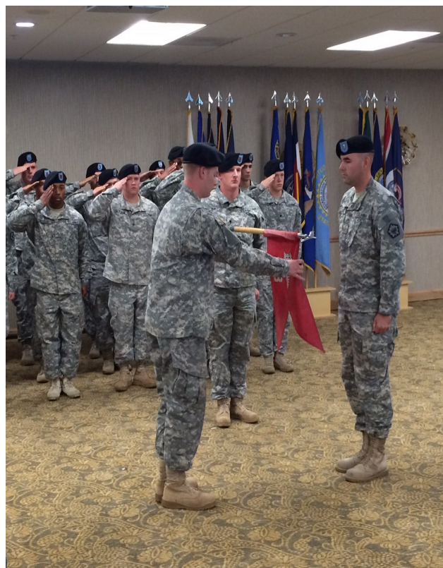
28th Engineer Detachment (Concrete) Inactivation Ceremony 15 September 2015