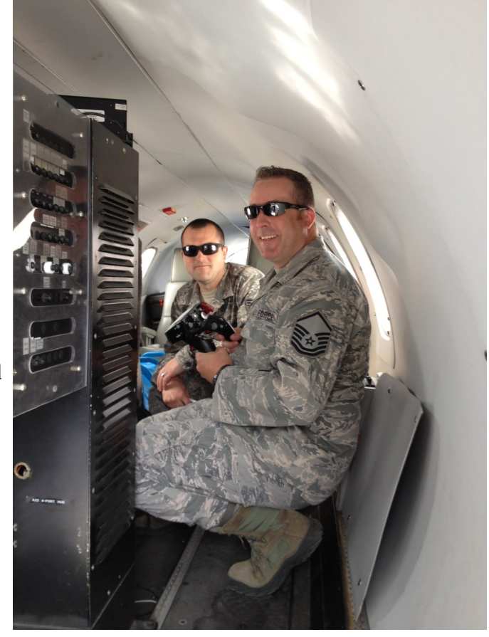
Members of the 242nd Combat Communications Squadron at work during Exercise Northern Strike 15 in July 2015