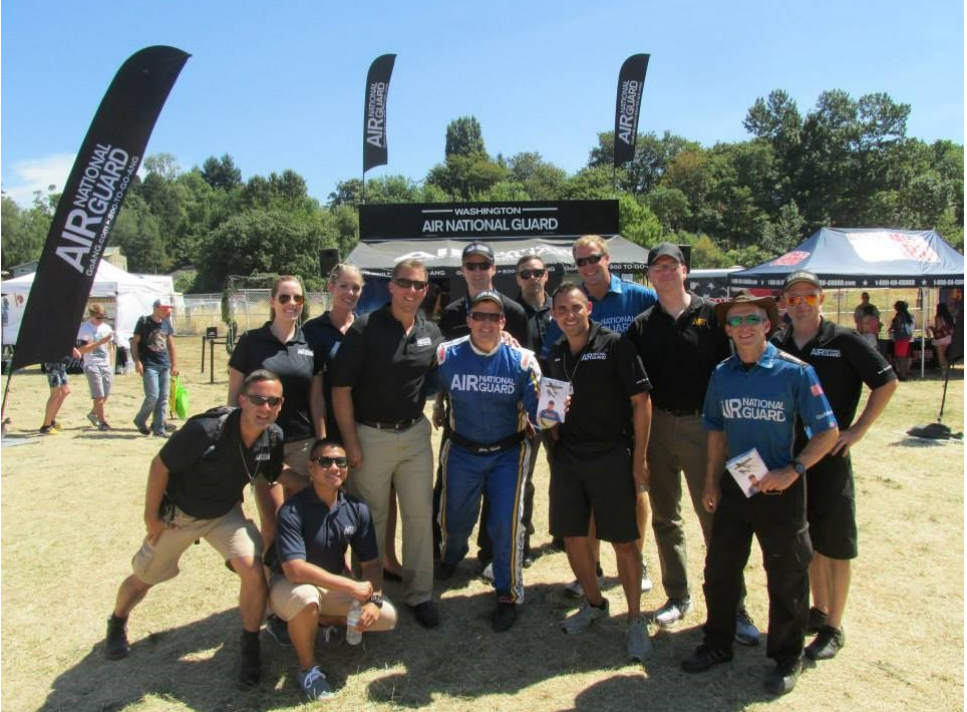
Air National Guard recruiters at the Air National Guard Mobile Experience at Seafair in August

"National Guard Bureau as a whole is really focusing in the right direction for these types of events."