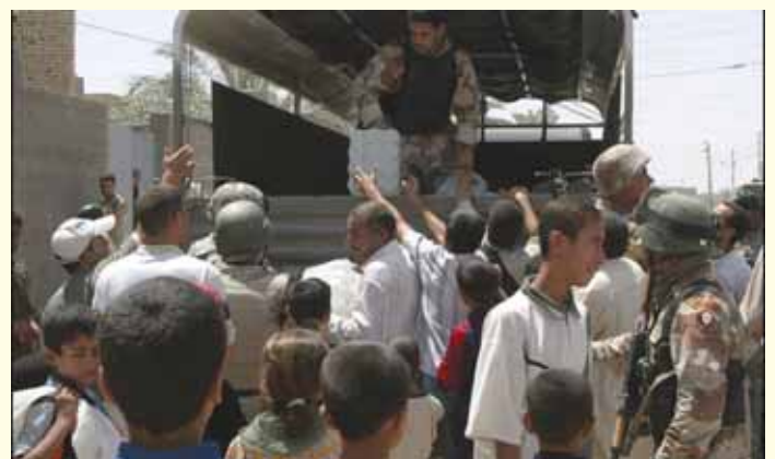
Iraqi Army Soldiers hand out bottles of water during a humanitarian aid mission in Ramadi, Iraq.

BAGHDAD — Locals greeted Iraqi Soldiers in central Ramadi with handshakes and smiles. Those smiles are