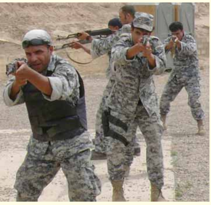
Iraqi National Police members practice battle drills in the Iraqi Security Force Training Center at Combat Outpost War Eagle in the Rabii neighborhood of Baghdad's Adhamiyah District.