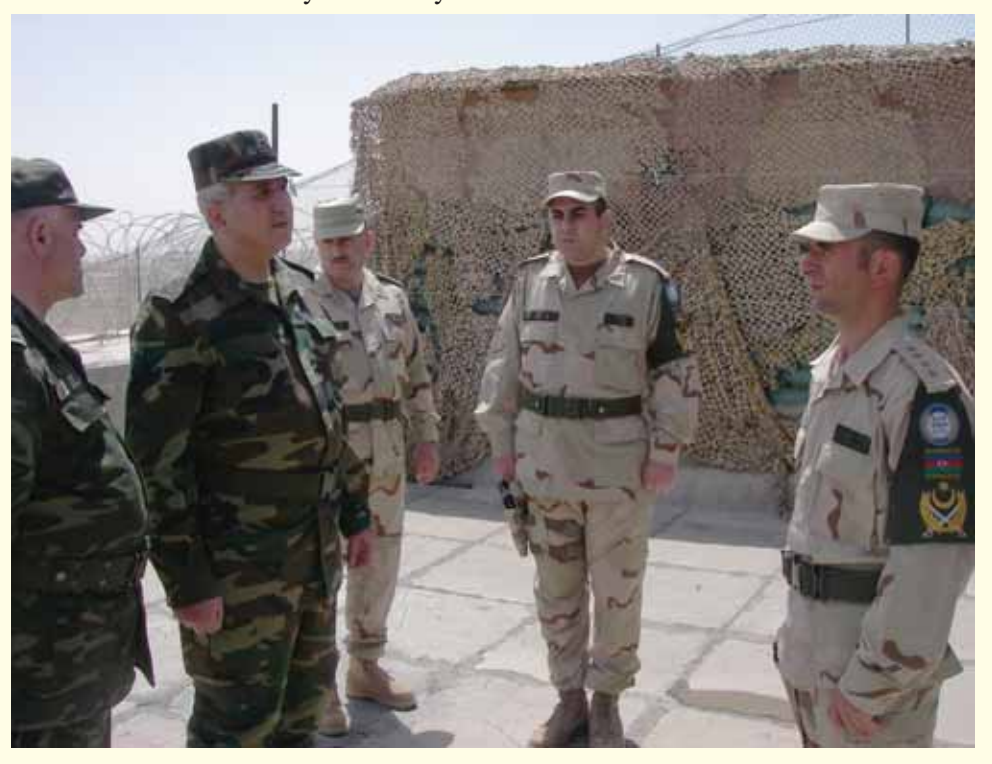
are serving shoulder to shoulder with Deputy Minister of Defense with Company Commander inspecting check points

time when the weaker side chooses terror as their main tactic of operations. The outcome of this conflict depends not only on the results of military operations on the ground; but also the insurgent tactics of conducting suicide attacks on civilian population. For the insurgents, this is preferable to facing conventional armed forces. We have to put all available means to prevent the spread of this tactics chosen by the enemy.