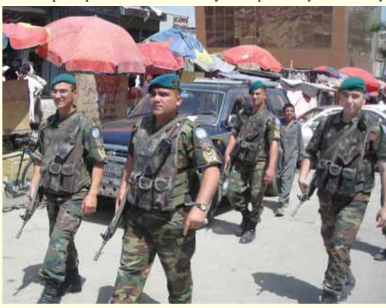
Azerbaijani contingent on foot Patrol in Kabul Afghanistan

Hadithah Dam, Iraq. The Hadithah Dam is one of the principal sources of electricity in Iraq. Security and stability