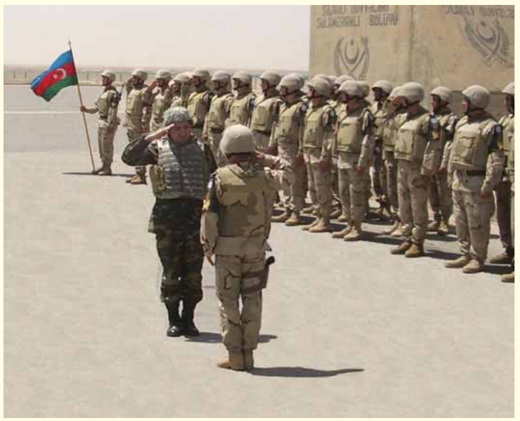
Salute of Deputy Minister of Defense by Azerbaijani Contingent at Haditha Dam

at the dam is one of the essential elements for a successful mission in Iraq. By accomplishing high levels of security at the Hadithah Dam, the Azerbaijani Peacekeeping Company is providing favorable conditions for the Coalition and U.S. forces. This allows them to fully engage the enemy without worrying about one of the main sources of electricity in Iraq. Many accolades have been made by high ranking officers and members of distinguished delegations who visited the