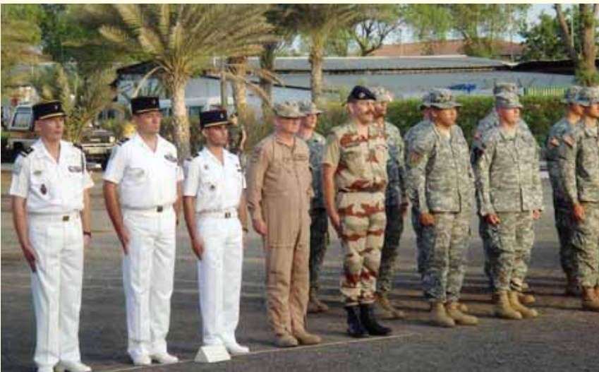
Members of the French and U.S. military participate in a desert survival training graduation held at the 5th French Marine Regiment parade grounds near Camp Lemonier, Djibouti.

CAMP LEMONIER, Djibouti – Nearly 40 Soldiers and Marines assigned to Combined Joint Task Force-Horn of Africa, attended a desert survival training graduation held at the 5th French Marine Regiment parade field, near Camp Lemonier, Wednesday, after completing a 10-day desert survival course July 1-10.