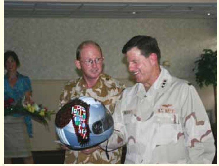
Dutch SNR Farewell party