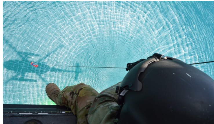
A Soldier with Charlie Company, 1st Battalion, 171st Aviation Regiment guides a basket into the North Arabian Gulf to pull a Soldier out of the water during a search and rescue exercise June 16, 2015, at the North Arabian Gulf, Kuwait.