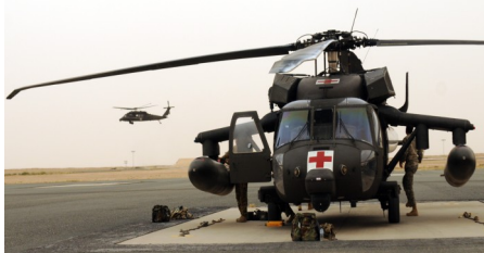
An aircrew from 2nd Battalion, 3rd Aviation Regiment wraps up after a long day on the flight line, April 24, 2015.