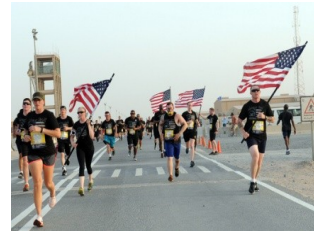
Soldiers participate in the 'Never Quit' 5k, April 18, 2015.