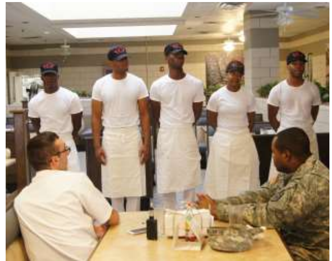
The Soldiers anxiously wait to see who will be crowned the first Chef of the Month.