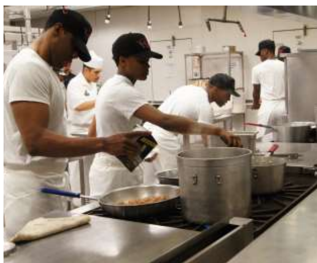
The Soldiers prepare their entrée for the Chef of the Month competition.