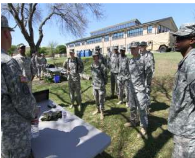
The competitors receive their briefing before navigating the urban land navigation portion of the competition.