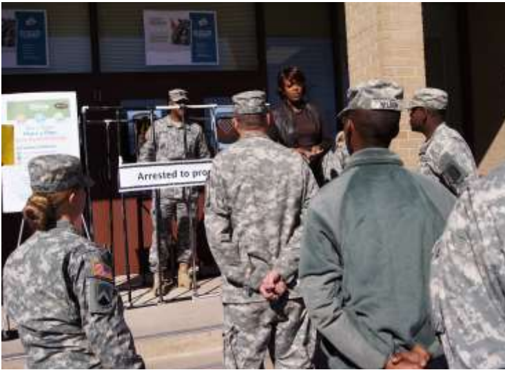
The members of the 57 th Expeditionary Signal Battalion's Color guard prepare to march to the school's flagpole to raise the American and Texas flag as part of the school's annual ceremony. .