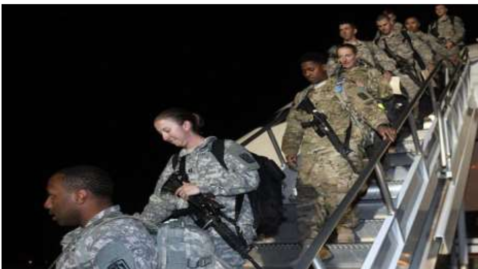
Soldiers with the 40th Expeditionary Signal Battalion disembark from a plane on Libby Army Airfield Wednesday night on Fort Huachuca. The soldiers have been in the middle east since deploying there last May.

Waiting for the 40th contingent were friends and families who were at Barnes Field House, where after a short ceremony they would wait for the order, “release your units to their families,” signaling the completion of the trip home.