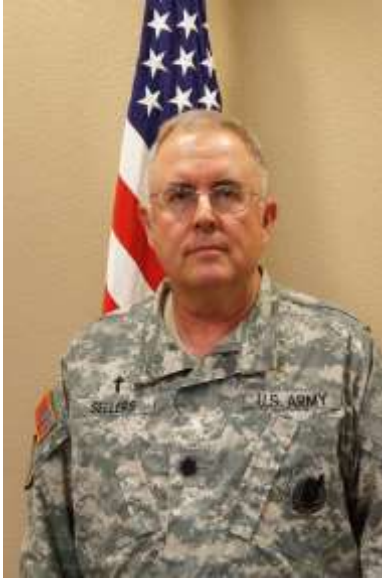
Lt. Col. Zan Sellers