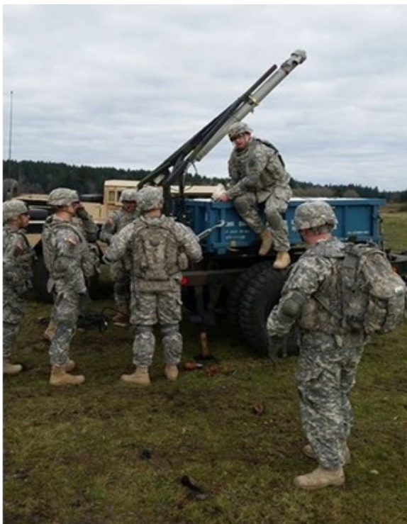
3PLT Soldiers prepare a Mine Clearing Line Charge, which they fired in demonstration for visiting Indian Army leaders.