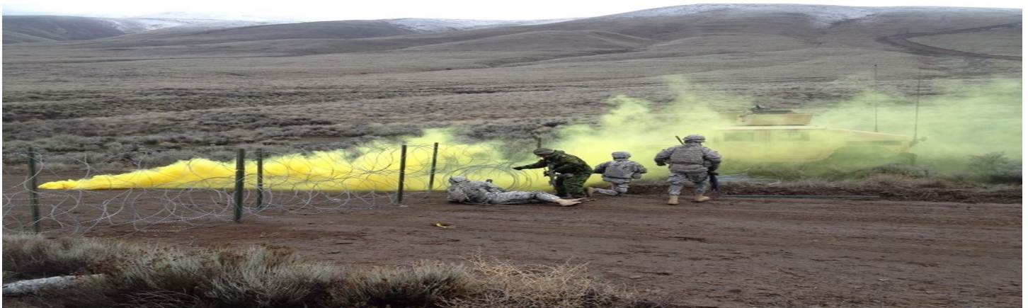
Soldiers from 571st Sapper CO and 22nd ECC work together with Soldiers from the Canadian Army at the Yakima Training Center.