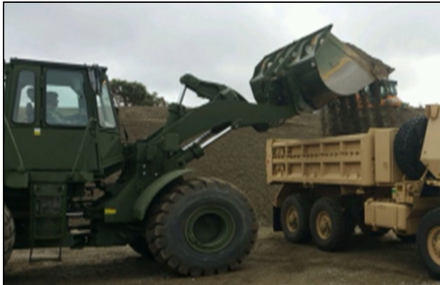
Soldiers from the Equipment Platoon working on a project for the JBLM Fire Department