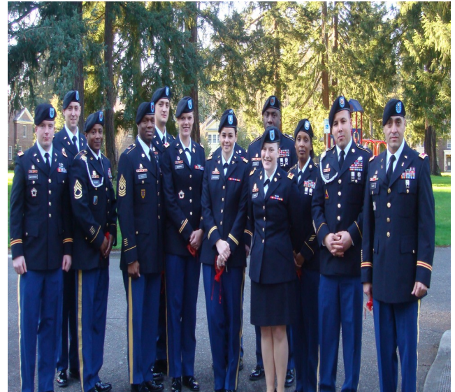
The Provider leadership at the BC's house for the Chinese New Year Reception