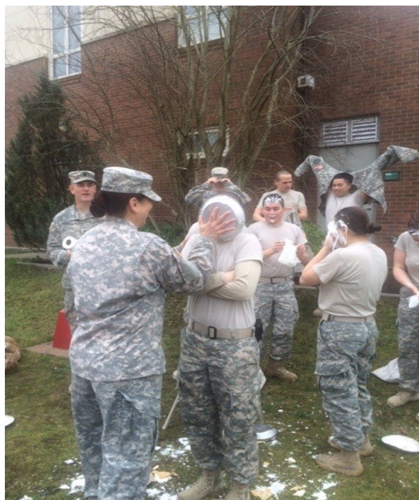
Regulators participating in the FRG Pie in the Face Fundraiser.