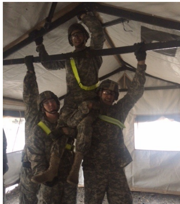
Soldiers from the 28th EN DET assisting Tent set –up in TOC Exercise.