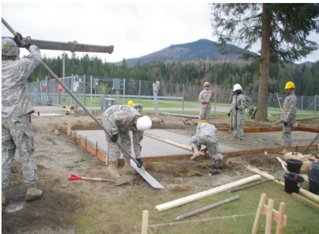
585 working to improve the volunteer center at Mud Mountain Dam, WA