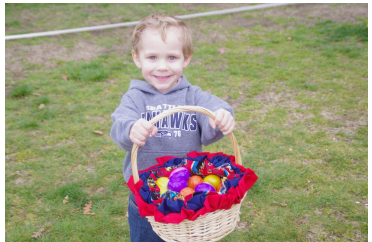
Egg hunt at the BN Spring Festival 28MAR15