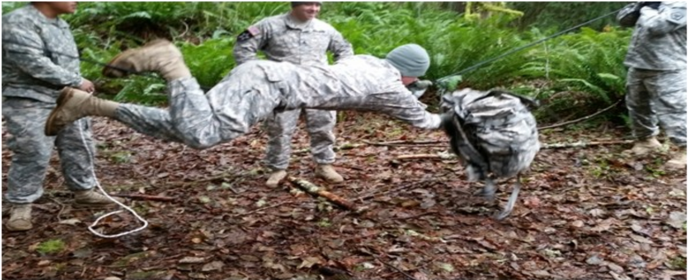
3PLT Soldiers practice knots and maneuvering with equipment through austere terrain.