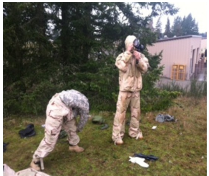
2PLT “Hellhound” Soldiers don MOPP gear during training. FIDO is prepared to deploy in all environments.