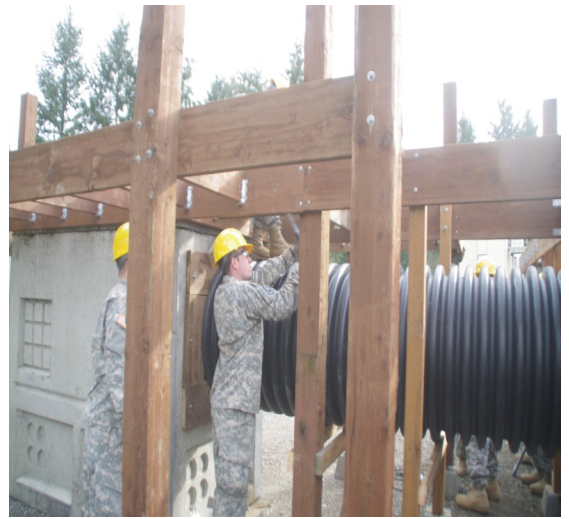
585 Working at McChord AFB on a Skills Trainer for the McChord Fire Department