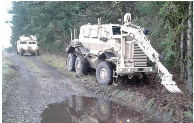
A Buffalo conducts an interrogation during the Company FTX in February