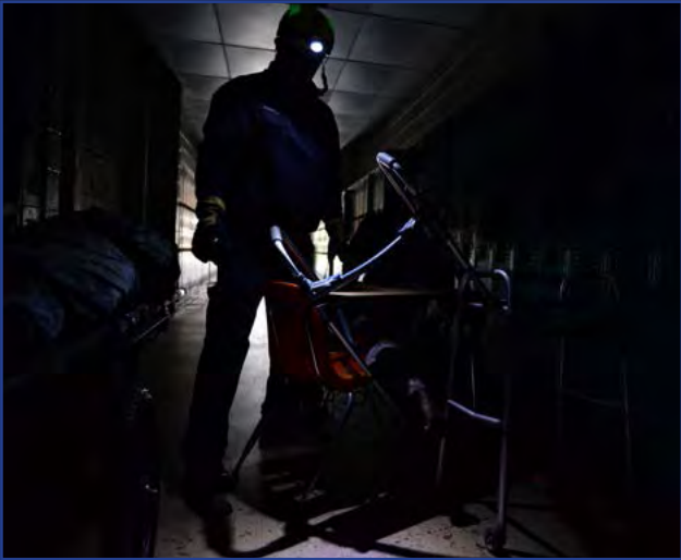
Greenville County search and rescue personnel make their way through the old Woodmont High School in search of simulated victims, Mar. 10, in Greenville, S.C.