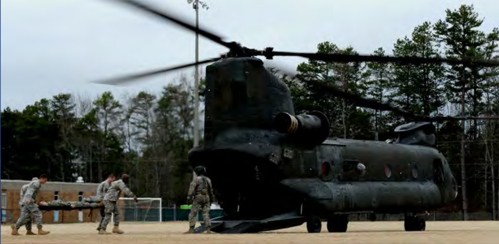
Simulated victims are loaded onto a CH-47 Chinook with the South Carolina Army National Guard after being extracted from the old Woodmont High School, Mar. 10, in Greenville, S.C.