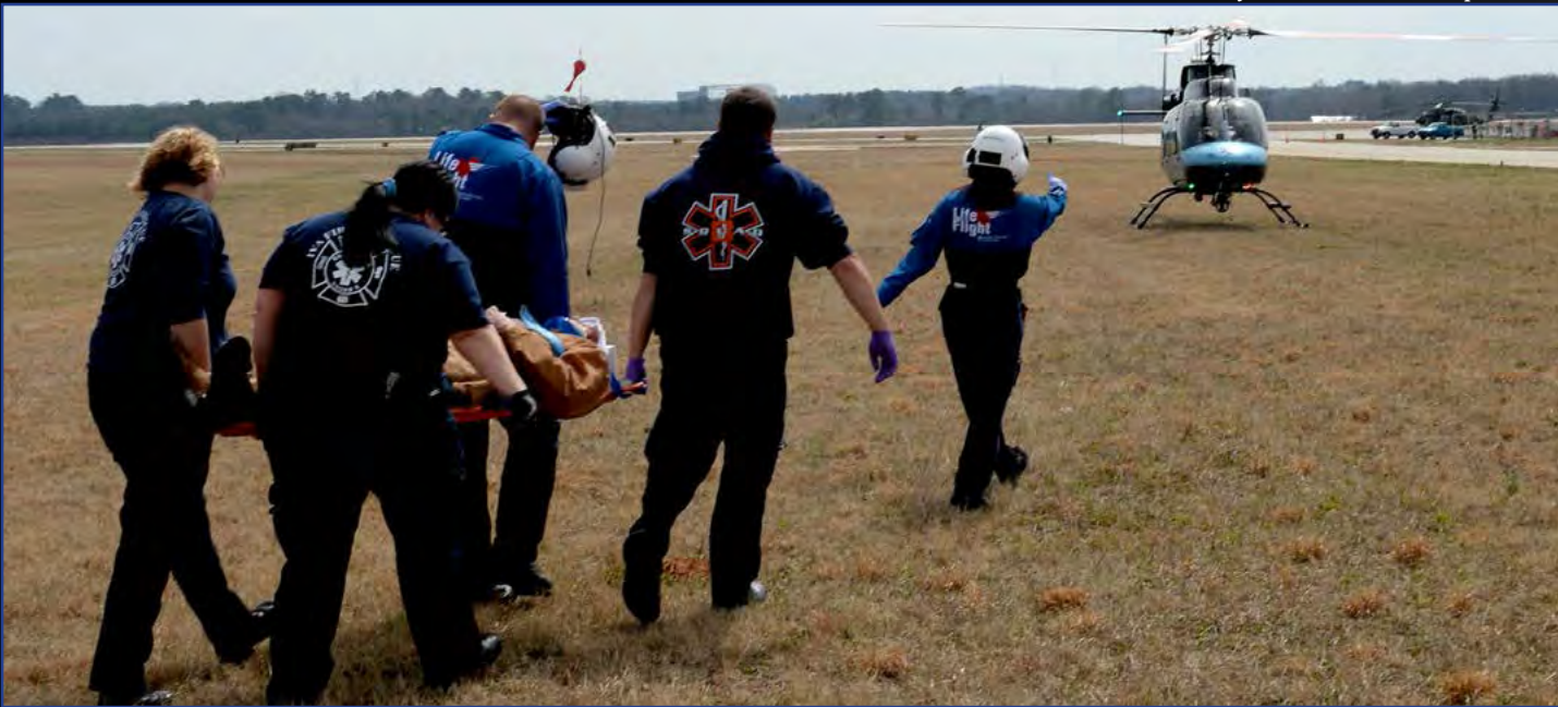
(Top) AnMed Health LifeFlight personnel load a simulated victim onto a helicopter to transport to the AnMed Health Medical Center. (Bottom) An Anderson County first responder assesses a victim from a simulated hard landing made by a CH-47 Chinook. (Right) Greenville County search and rescue personnel make their way through the old Woodmont High School in search of simulated victims.