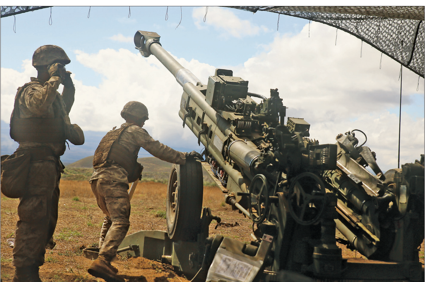
The third gun of Bravo Battery, 1st Battalion, 12th Marine Regiment fires a 155 mm howitzer under camouflage netting on Pohakuloa Training Area during Operation Spartan Fury 15.2, Monday.

What does this mean for you? Inform your Marines, sailors, family members and guests of the rules and regulations. Highlight the safety concerns that are there and reinforce good driving habits that will help prevent undesirable consequences.