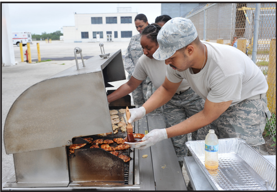
U.S. Force services Airmen from the 180th Fighter Wing prepare grilled chicken during a training exercise at Naval Station Key West, Boca Chica Island, Florida, Jan. 14, 2015. Services Airmen planned and prepared meals coordinated lodging for 180th Airmen participating in the exercise.

Training missions like these are of the utmost importance to maintain pilot's skills. Training like this cannot take place over civilian communities