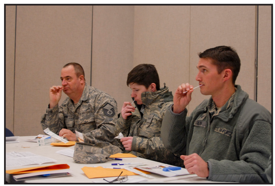
U.S. Air Force Airmen from the 180th Fighter Wing swab the inside of their cheek for the registration process during the wing's two-day bone marrow registration drive Jan. 10 2015, part of the Salute to Life Program. The Salute to Life Program, also known as the C.W. Bill Young/Department of Defense Marrow Donor Program, works with active duty and their dependents, guard, reservist and Department of Defense civilian employees to facilitate marrow and stem cell donations. All of the donors are volunteers and since the program inception in 1991, more than 750,000 individuals to fight against blood cancer and other fatal diseases.

Service before self, a fundamental Air Force value, is the selfless act of serving your country,