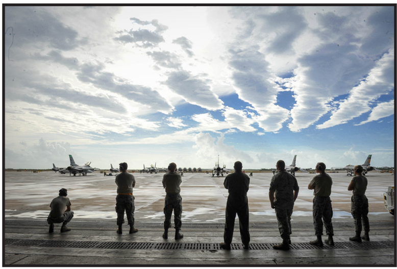
U.S. Airmen from the 180th Fighter Wing, Toledo, Ohio watch F-16 Fighting Falcon flight line operations at Naval Station Key West, Boca Chica Island, Florida, Jan. 12, 2015 during a training exercise.

Units from across the country come to train with the F-5 Navy detachment in Key West because it spe-