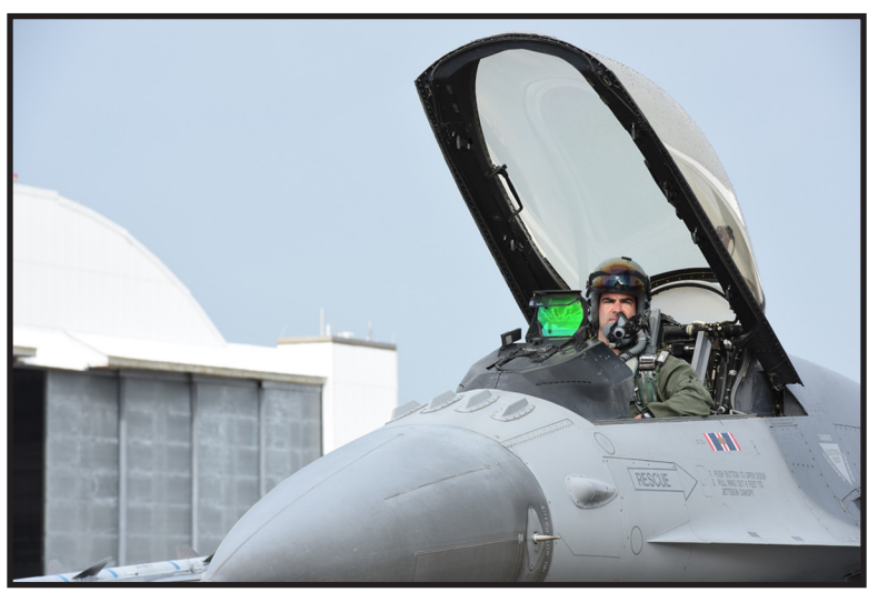
U.S. Air Force Lt. Col. Chad Holesko, an F-16 pilot from the 180th Fighter Wing, prepares for a training sortie on the flight line of Naval Station Key West, Boca Chica Island, Fla., Jan. 12, 2015. The 180th Fighter Wing deployed to Key West to conduct dissimilar aircraft training with F-15's from the 159th Fighter Wing, from New Orleans and F-5's from Naval Station Key West.

"They can replicate a variety of different aircraft,