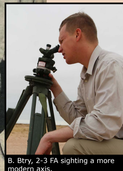
B. Btry, 2-3 FA sighting a more modern axis.