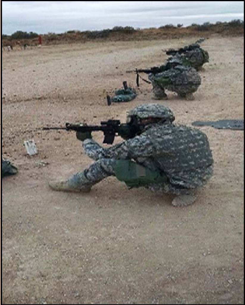
Above: Soldiers with Attack Company, 4th Battalion, 17th Infantry Regiment, 1st Brigade Combat Team, 1st Armored Division, fire their M4 rifles while wearing promasks, at Fort Bliss, Texas, Jan. 21. Soldiers wear their masks to enhance their proficiency. Right: A grenade thrown by an Attack Company, 4th Battalion, 17th Infantry Regiment, 1st Brigade Combat Team, 1st Armored Division, Soldier, detonates near the Ivan targets on Range 4 at Fort Bliss, Texas, Jan. 21.

The Soldiers and leaders of Attack Company are excited for the training and missions ahead of them. For many, this will be their second iteration of gunnery and live fires. They are eager to improve upon their already stellar performance from last iteration and show they are the most lethal Soldiers in the READY FIRST brigade! FEAR NO ONE!