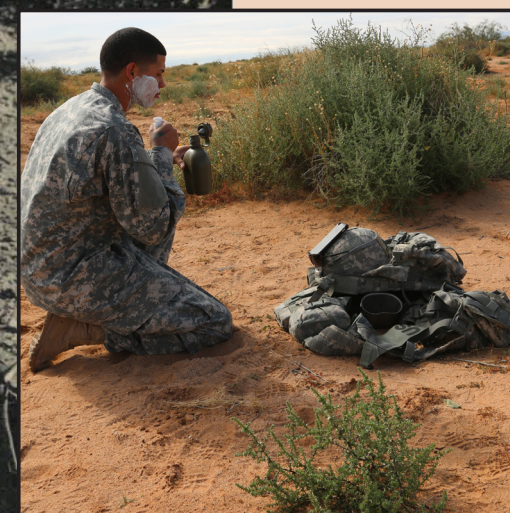
How our Soldiers make due in the field today.