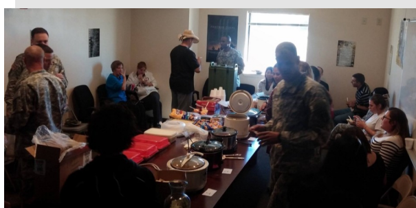
Soldiers and Families