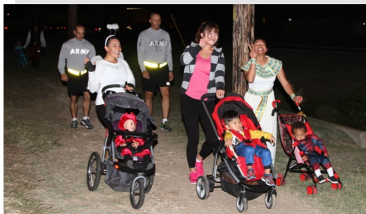
Soldiers posing immediately after the run