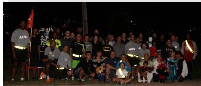
Company Soldiers and their Families after the run

On Halloween 2014, the company held a Halloween Family Fun Run. Soldiers and their Families were encouraged to participate by wearing their favorite costume. The run was a great opportunity to involve our Families in our daily physical fitness regimen with a Halloween twist. We thank all Soldiers and Families for their participation and look forward to next year's run!