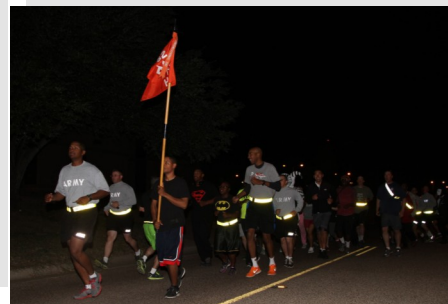
Running down Support Ave