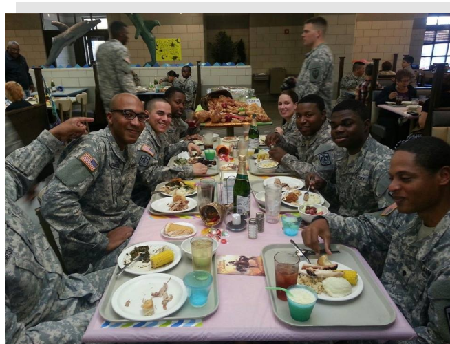
Soldiers enjoying the delicious Thanksgiving meal

Titan Soldiers and their Families took time out of their busy schedule to support their fellow Titan colleagues at the West Fort Hood DFAC. More than 25 Titan Soldiers and their Families visited the dining facility for the excellent food and welcoming atmosphere. Many Soldiers stated that the food was great and visiting the dining facility was a great way to start the Thanksgiving holiday.