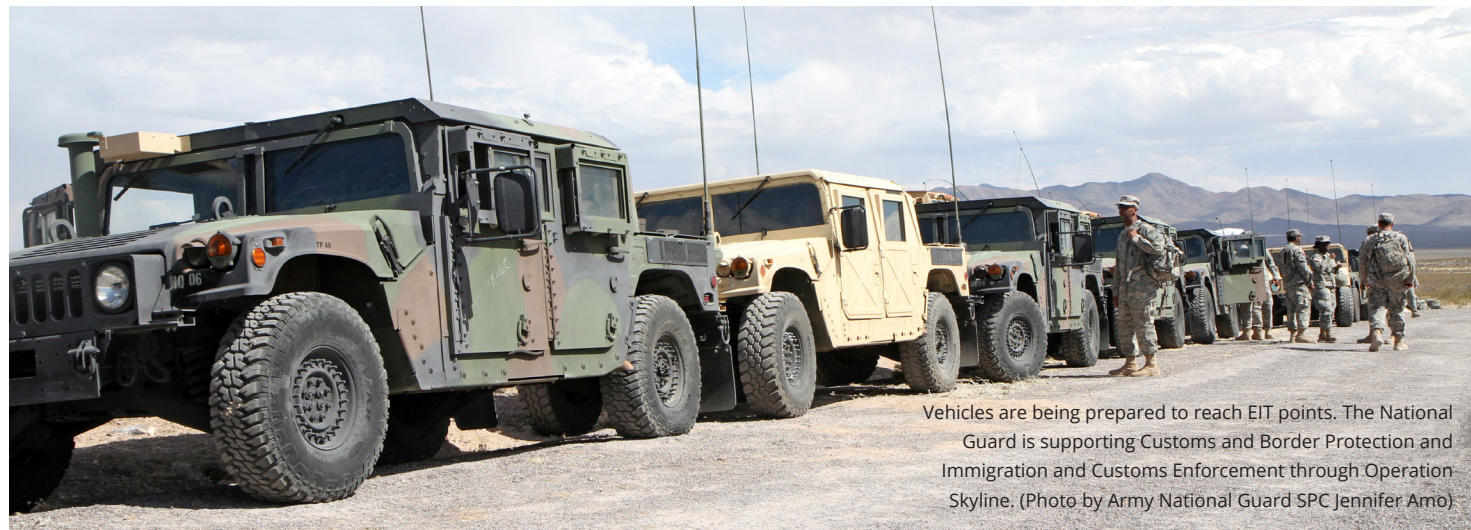
Vehicles are being prepared to reach EIT points. The National Guard is supporting Customs and Border Protection and Immigration and Customs Enforcement through Operation Skyline.