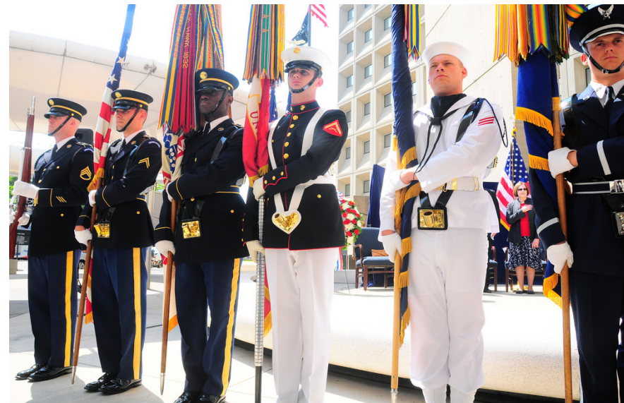
United States Department of Housing and Urban Development celebrated Memorial Day with a Commemorative Ceremony Thursday, May 22, 2014. Service members, both past and present, HUD staff, and community members were in attendance for the ceremony at Freedom Plaza.

"These were Japanese who were fighting for this country, the same country that had some of their relatives interred out west because we didn't trust them to be good citizens. But here we had the 442nd risking their lives, giving their lives for our cause."