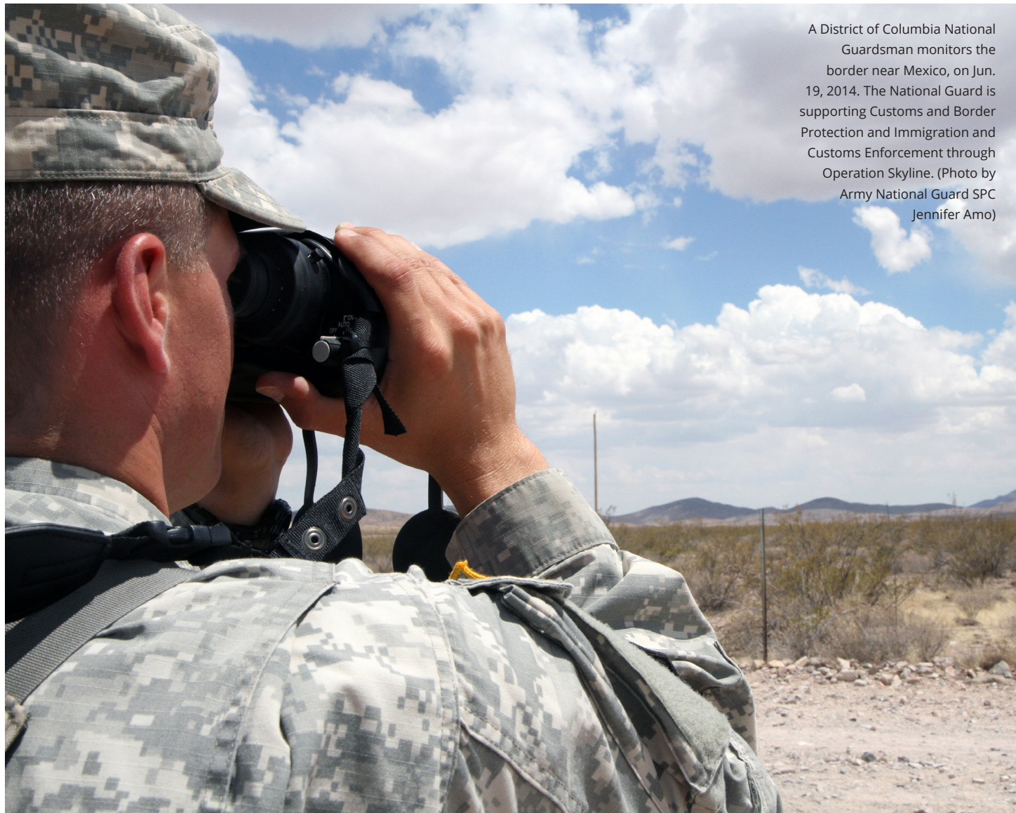
A District of Columbia National Guardsman monitors the border near Mexico, on Jun. 19, 2014. The National Guard is supporting Customs and Border Protection and Immigration and Customs Enforcement through Operation Skyline.