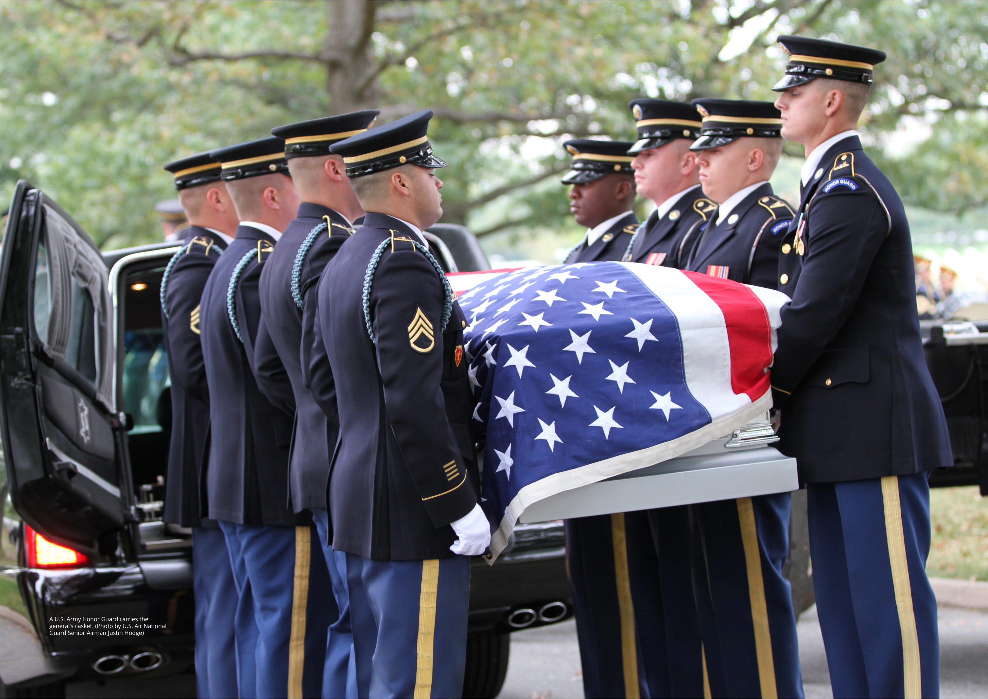
A U.S. Army Honor Guard carries the general's casket.