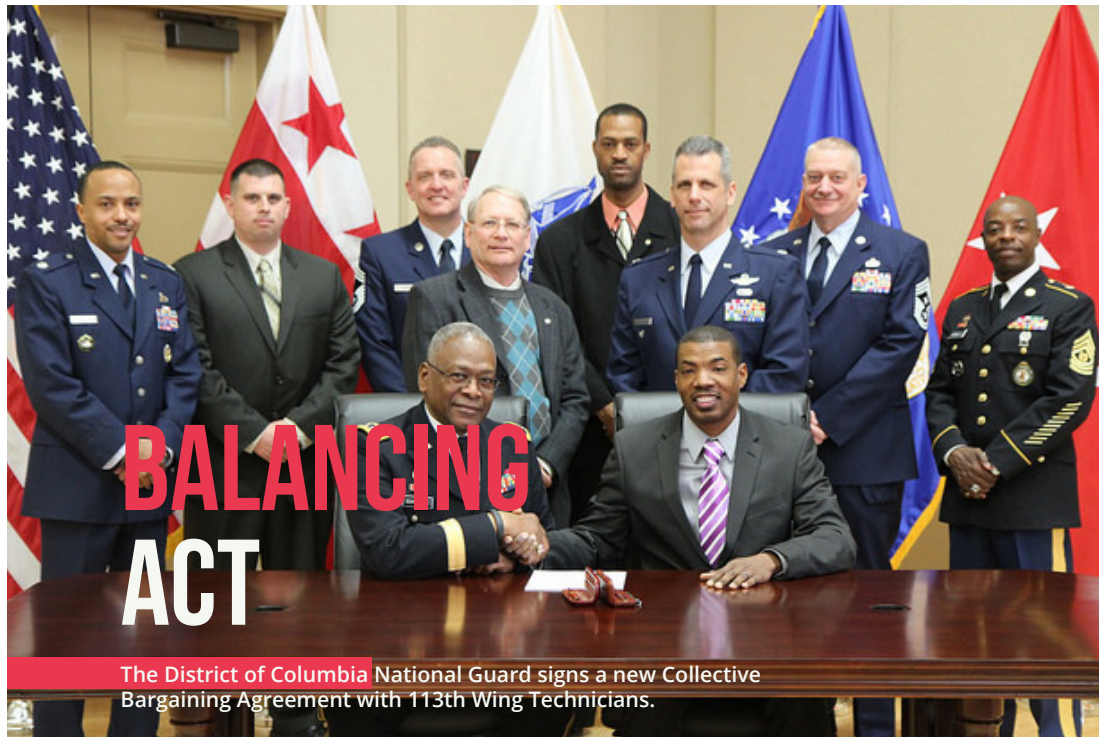
The District of Columbia National Guard signs a new Collective Bargaining Agreement with 113th Wing Technicians.