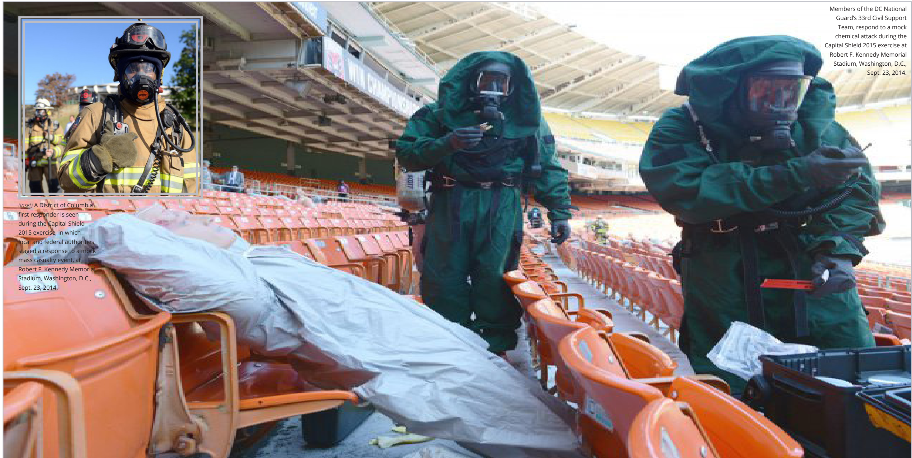
Members of the DC National Guard's 33rd Civil Support Team, respond to a mock chemical attack during the Capital Shield 2015 exercise at Robert F. Kennedy Memorial Stadium, Washington, D.C., Sept. 23, 2014.