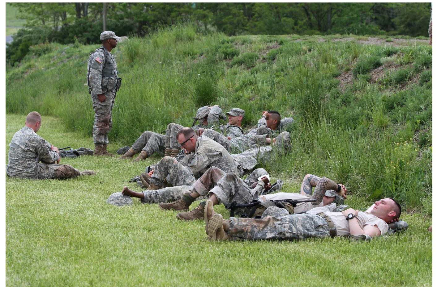
Soldiers competing the Region II best Warrior competition at Fort Indiantown Gap, PA take a moment to relax and conduct an After Action Review, after completing the mystery event that included a dead man pull, sprinting and shooting in the heat of the day.

If you or someone you know would like to compete for the title, "DC Army National Guard Best Warrior" and aspire for the top spot as US Army's Best Warrior, contact your unit First Sergeant.