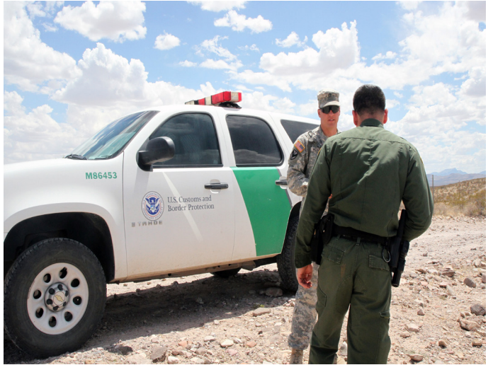
A Border Patrol agent talks to District of Columbia National Guardsmen manning an entry identification team watching the U.S./ Mexico border near New Mexico, during Operation Skyline, Jun. 19, 2014.