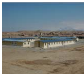
Poli-Alum Police Center