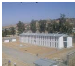
Police Company, Kandahar