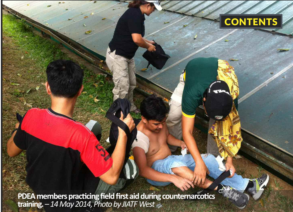
PDEA members practicing field first aid during counternarcotics training. – 14 May 2014