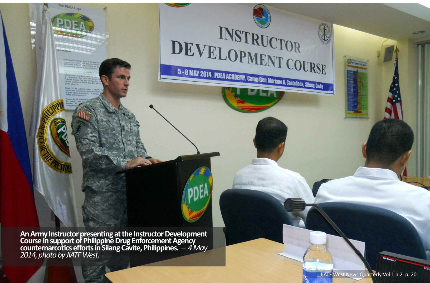
An Army Instructor presenting at the Instructor Development Course in support of Philippine Drug Enforcement Agency counternarcotics efforts in Silang Cavite, Philippines. — 4 May 2014