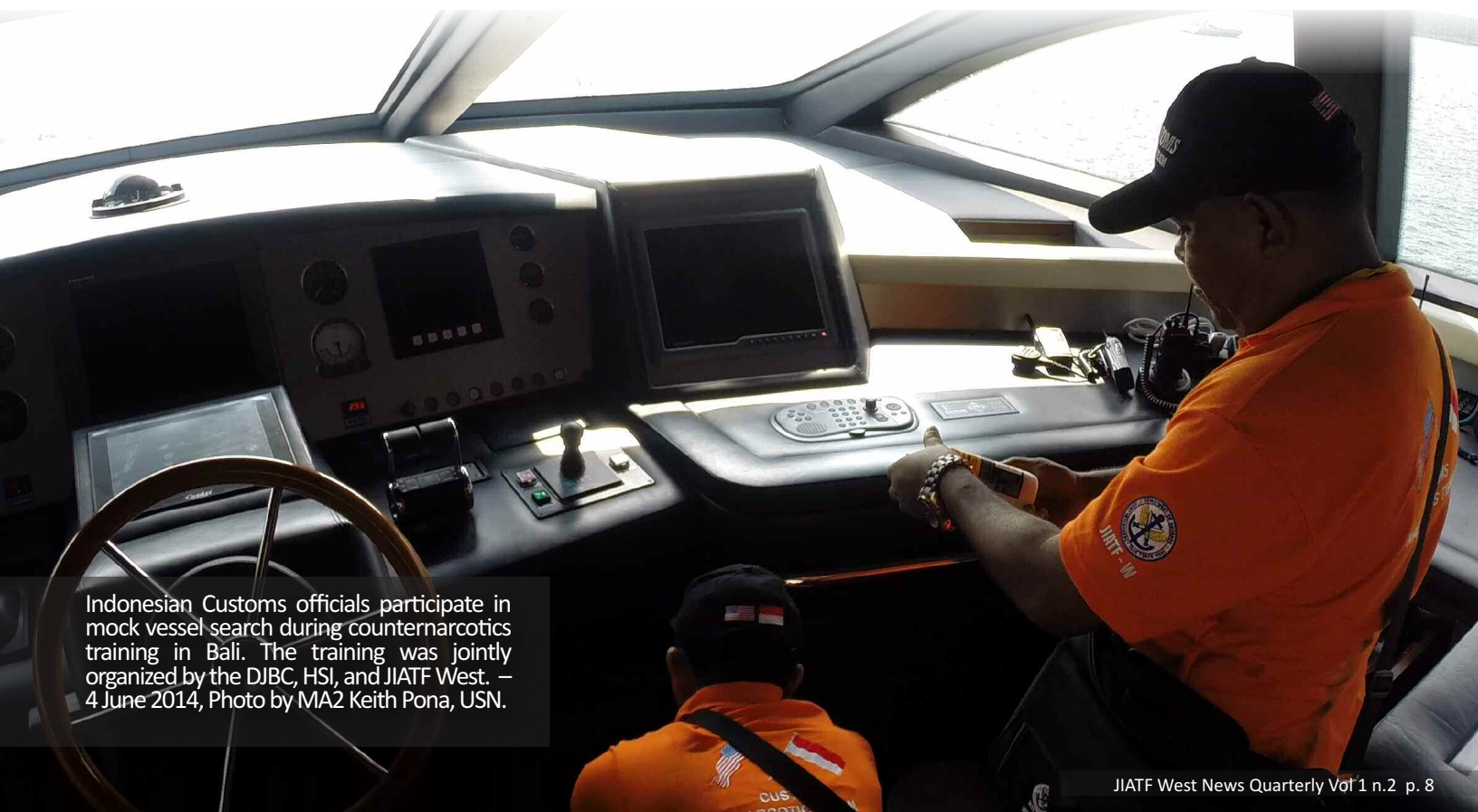
Indonesian Customs officials participate in mock vessel search during counternarcotics training in Bali. The training was jointly organized by the DJBC, HSI, and JIATF West. – 4 June 2014

This training also develops our relationship with our counterparts, and will enhance future IMS events in Indonesia.” □