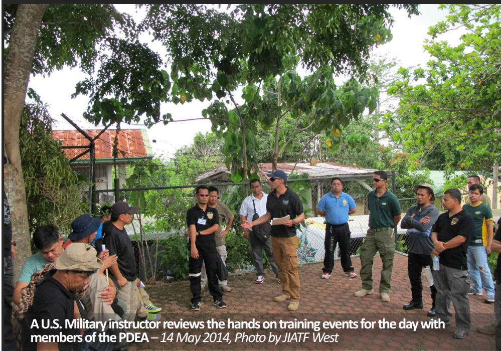
A U.S. Military instructor reviews the hands on training events for the day with members of the PDEA – 14 May 2014