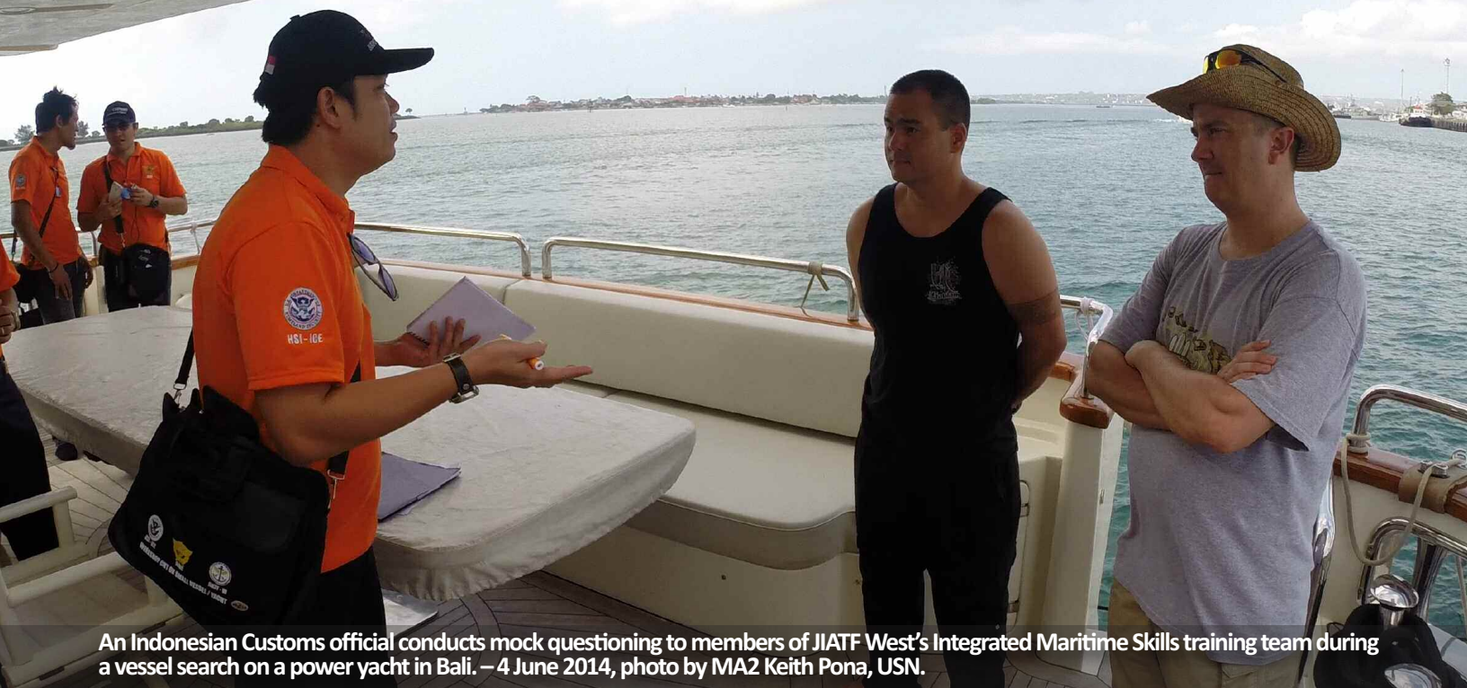
An Indonesian Customs official conducts mock questioning to members of JIATF West's Integrated Maritime Skills training team during a vessel search on a power yacht in Bali. – 4 June 2014, photo by MA2 Keith Pona, USN.

According to LCDR Bower, “The students demonstrated significant progress in the short time we were able to work with them.