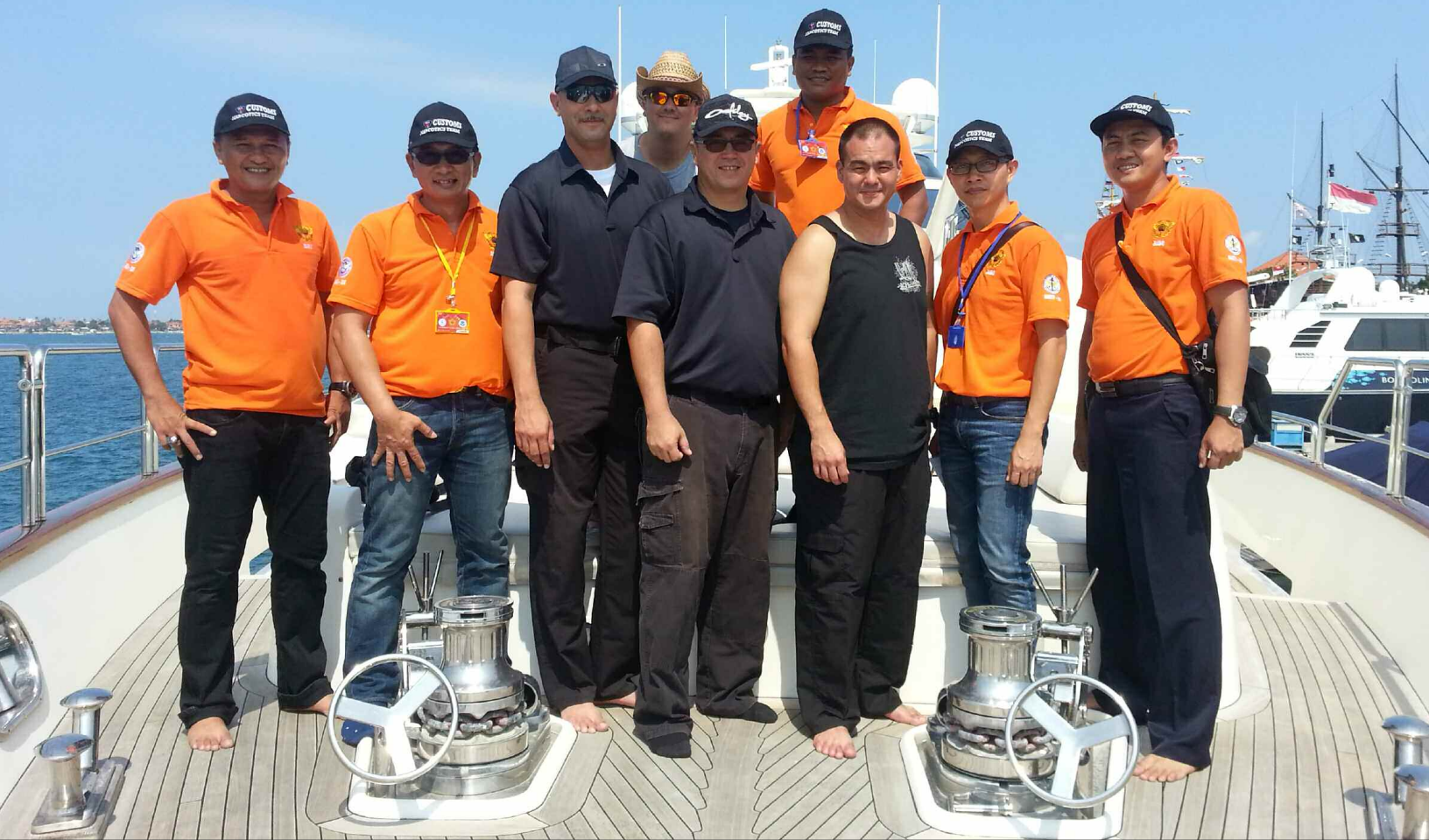
Indonesian Customs officials (orange shirts) stand with JIATF West IMS team members dressed as role players on the bow of a 26 meter power yacht during a mock vessel inspection in Bali. — 4 June 2014