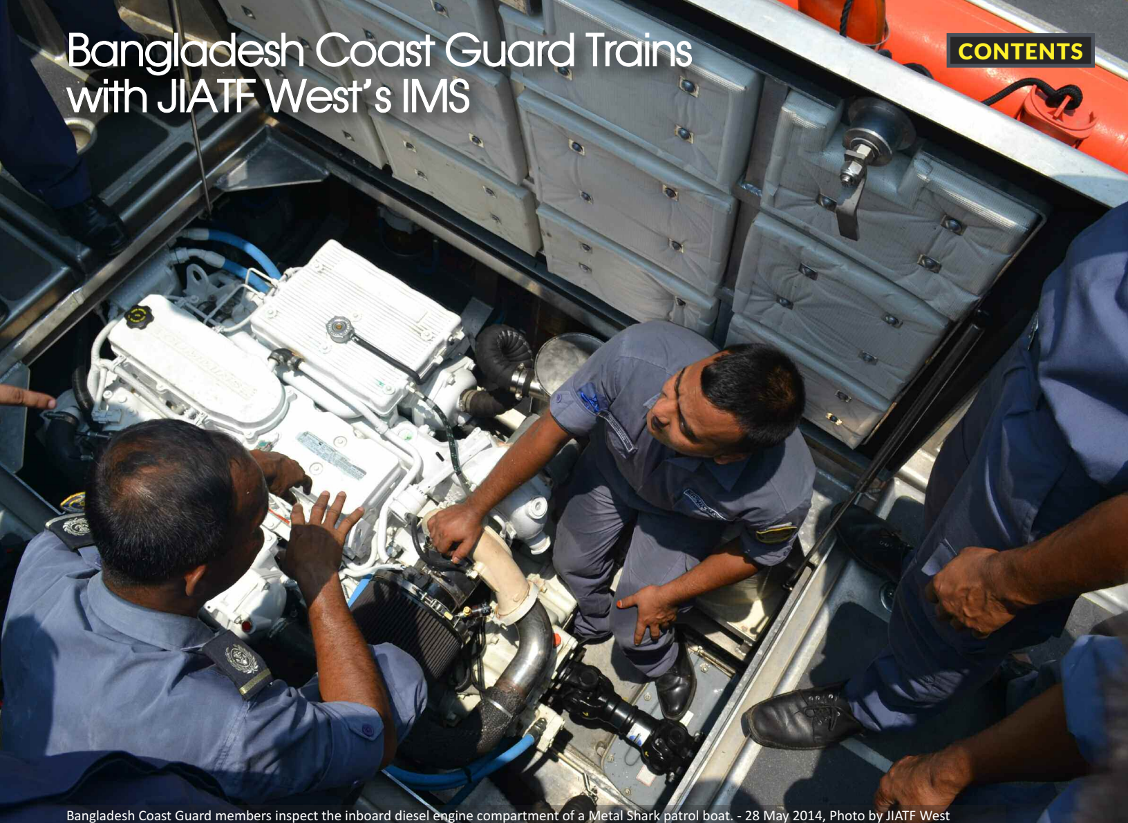
Bangladesh Coast Guard members inspect the inboard diesel engine compartment of a Metal Shark patrol boat. - 28 May 2014

He emphasized the importance of bilateral relationships and the meaningful impact on the BCG from better maintenance and repair capabilities.