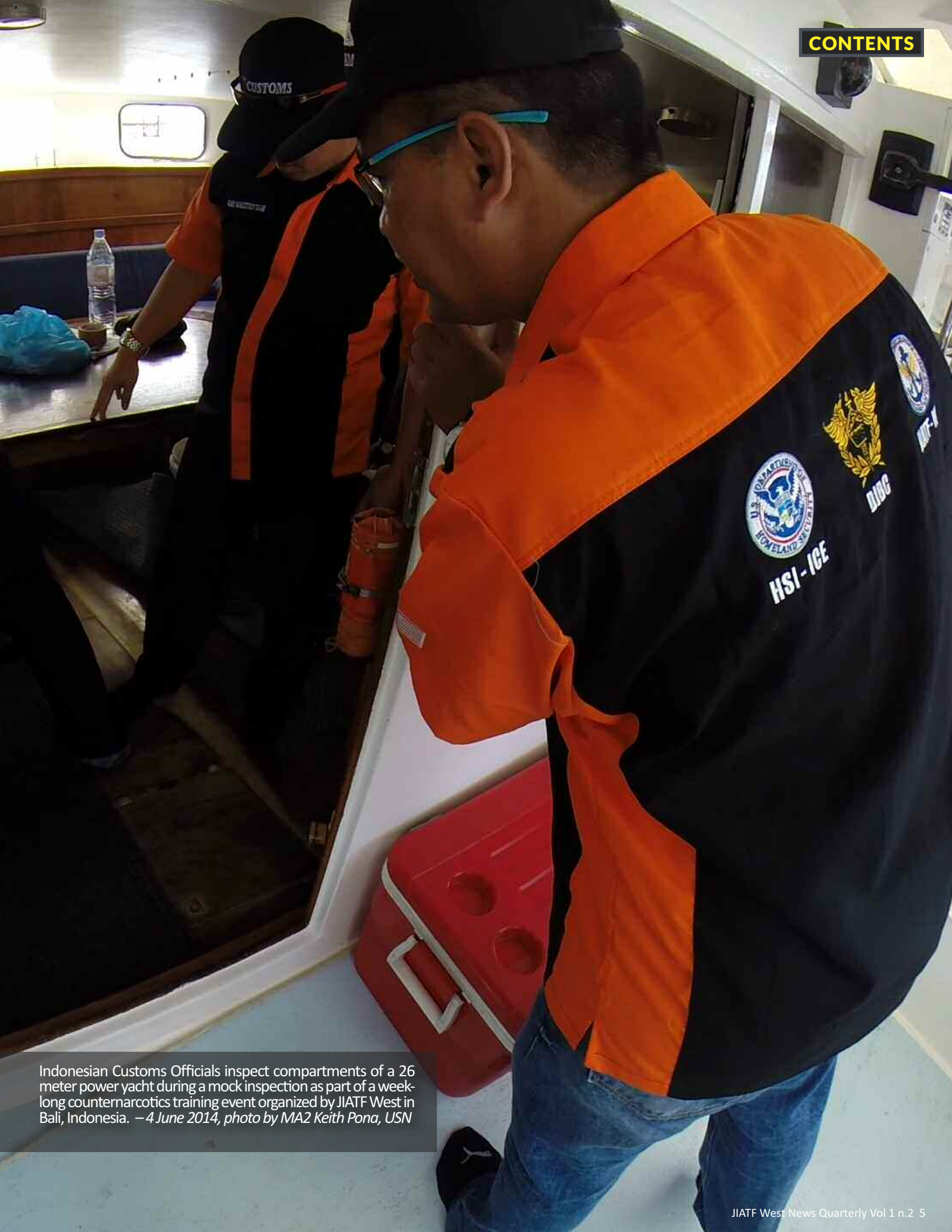
Indonesian Customs Officials inspect compartments of a 26 meter power yacht during a mock inspection as part of a week-long counternarcotics training event organized by JIATF West in Bali, Indonesia. —4 June 2014