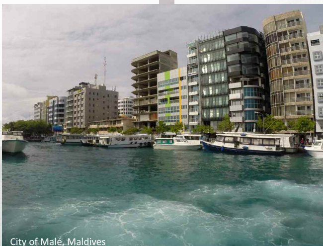
City of Malé, Maldives

“The security situation in the Indian Ocean is changing,” said COL Ibrahim. “And the threats the Maldives are facing will be shared with other regional countries.” He specifically welcomed the Bangladesh students and stressed that their presence and partnership were valued.