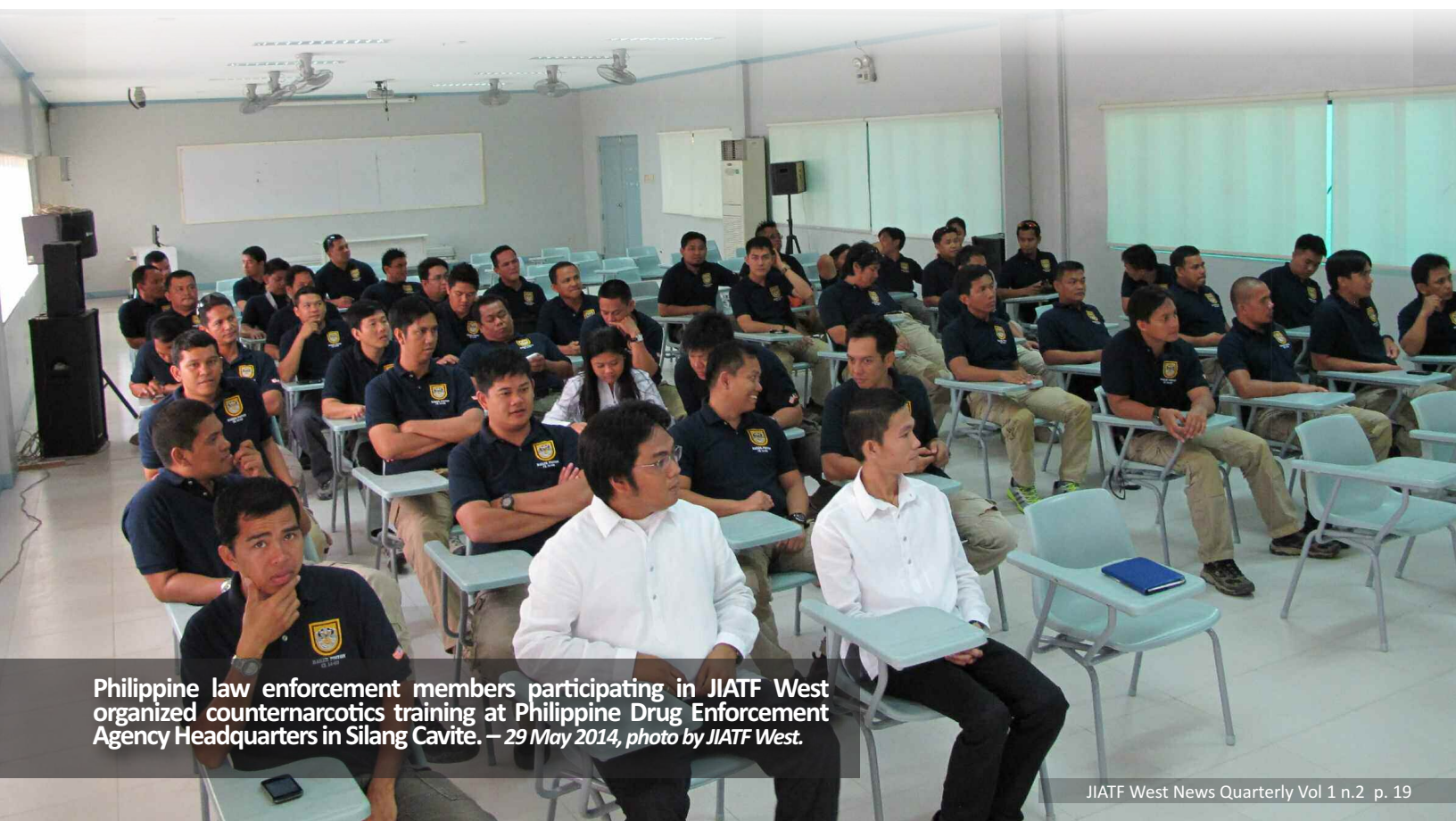
Philippine law enforcement members participating in JIATF West organized counternarcotics training at Philippine Drug Enforcement Agency Headquarters in Silang Cavite.

The five week Baker Piston 14-3 event was from 5 May to 7 June with PDEA units in the Silang Cavite area. The training event was designed as intermediate level training for units and individuals who had previously trained with JIATF West. The event focused on Instructor development and tactical operations. Advanced rifle and pistol marksmanship and medical first aid were some of the other topics covered.