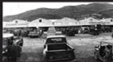
Freedom Hill Exchange