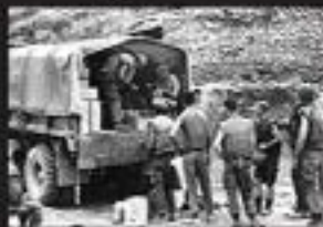
Mobile PX between DongHa and Con Thien