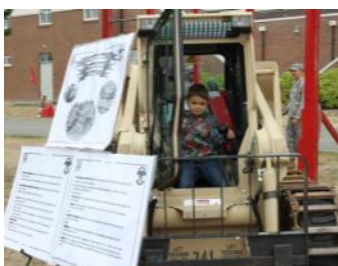
"Triple Nickel" Family Day showcases Soldiers' work

All the while, training continues, in order to ensure Soldiers are combat ready for the next Triple Nickel mission.