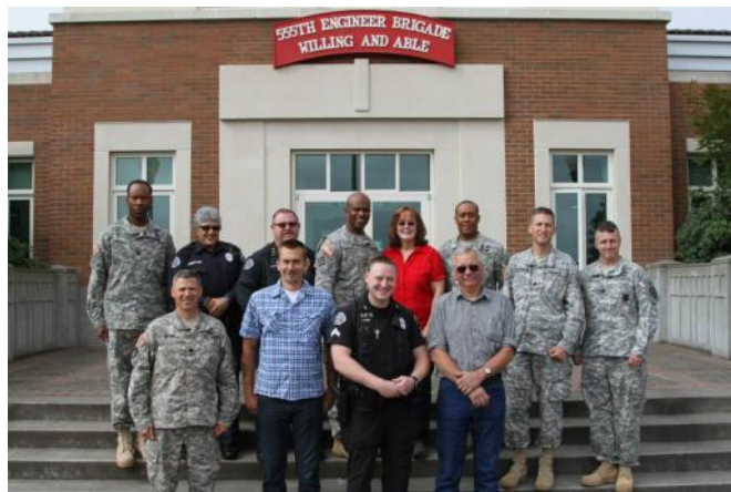
The Command Teams of the Triple Nickel and the City Council of Roy outside of the Brigade Headquarters.