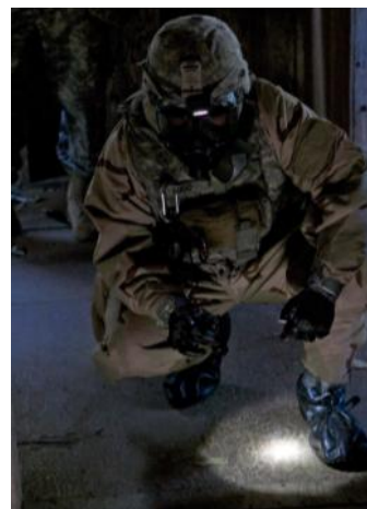
110th Chemical Soldier searches the area to find signs of WMD material.

build a pattern makes follow on operations easier and enables the unit the ability to deal with threats before they arise.