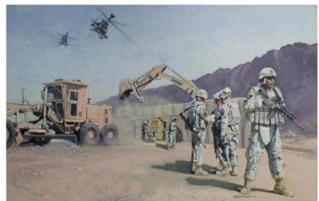
CLEAR - HOLD - BUILD

More information, including how to order, is available at 555Soldierfund.com .