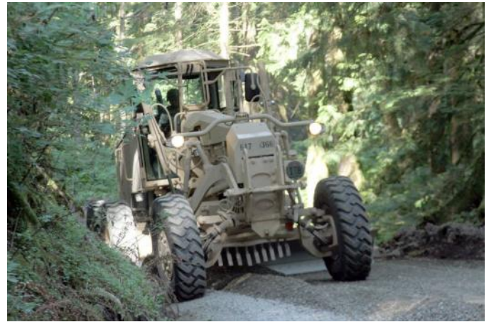
Soldiers with the 617th Horizontal Construction Company assist Seattle USACE with the construction of a road for the Mud Mountain Dam complex.

"We are a horizontal construction company, so this is crucial to our training and in line with our skills, but we don't always get this sort of opportunity," Sackmann continued. "We cannot do many construction projects around JBLM due to how densely populated it is." "It was real-world training in open area so we're capable of