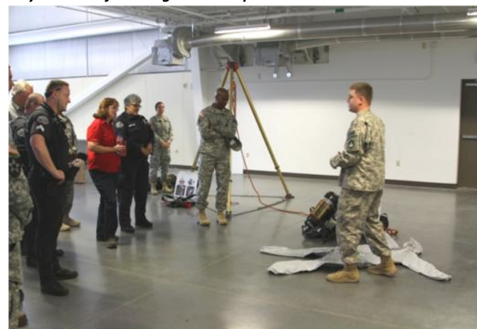
Soldiers from 110th Chem show the Council of Roy their decontamination equipment and how they would respond to a chemical threat