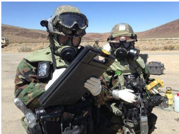
Soldiers from the 110th conduct a mission at NTC as part of their Certifying Training Event