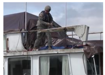
710th EOD Soldier disarms an IED on a derelict boat while participating in Ravens Challenge.

us. I have been involved with Raven's Challenge for the past two years and the training out here has always been excellent."