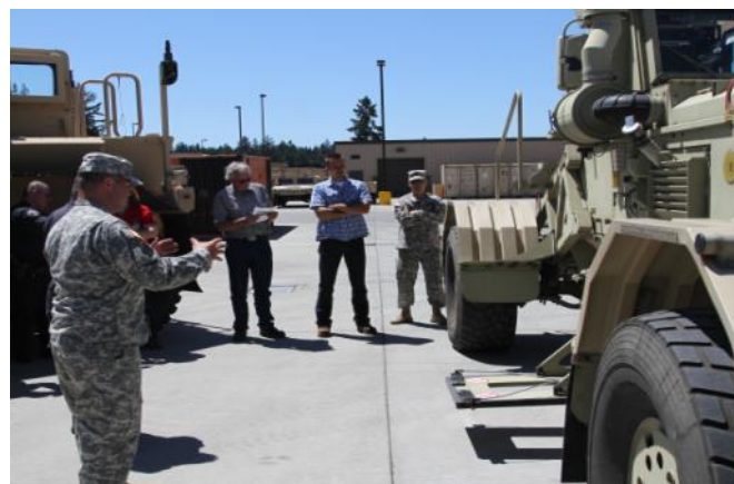
Soldiers from 864th show the Council of Roy the Husky and explain its mine detecting capabilities.