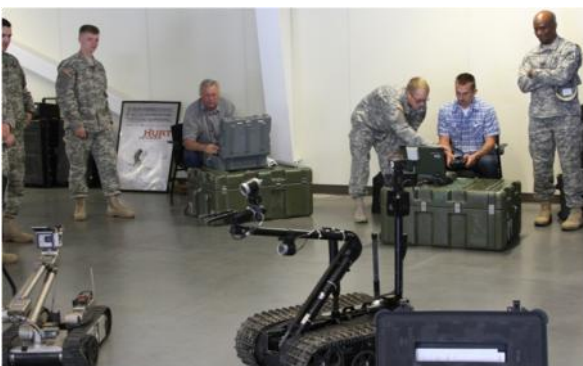
Council members of Roy compete in a Robot Race hosted by 3rd EOD to see who could reach the bomb first.

Editor's Note: The Brigade thanks Roy for always supporting the Triple Nickel.