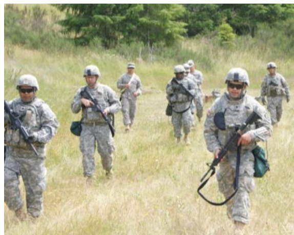
3d EOD Soldiers conduct patrols to prepare for their Field Training Exercise at Satsop Washington.