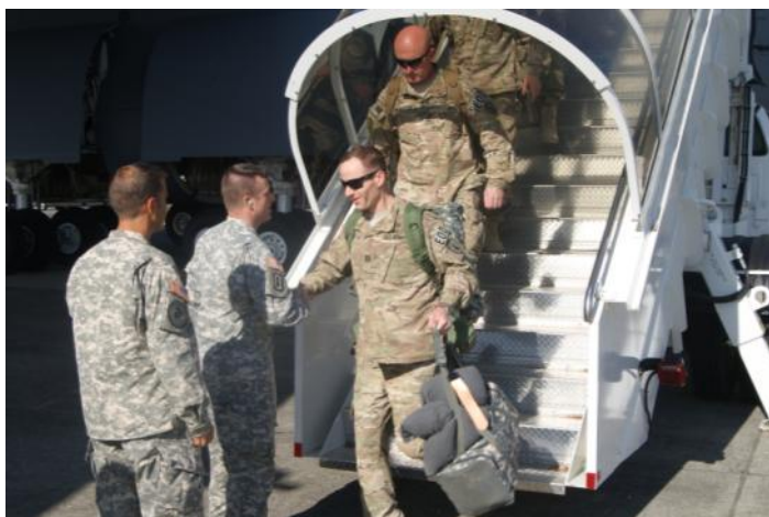
3d EOD Soldiers from the 129th are welcomed by their Battalion Commander after redeploying from Afghanistan.

"53D's victory at the Group ToY Competition is evidence of rigid training."