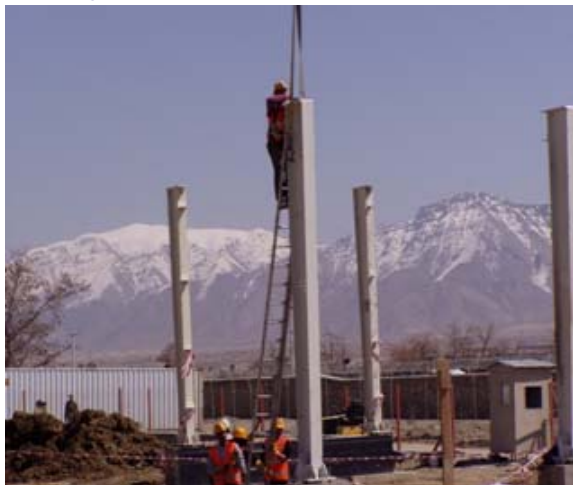
Construction continues on a Kabul military training facility.