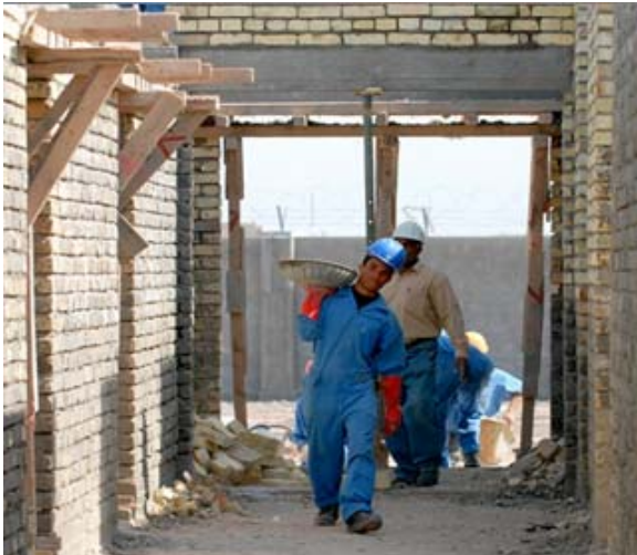
An Iraqi laborer brings mixed mortar to the construction site of a new regional courthouse building in southern Iraq.