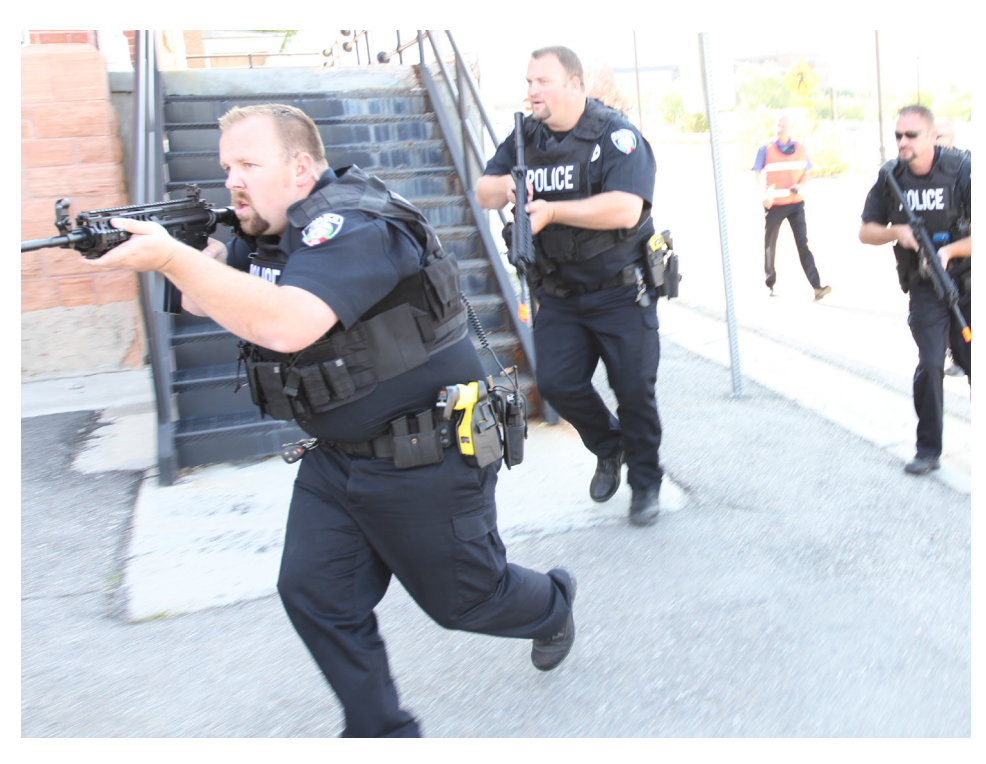
Detectives with the University of Utah Police Department respond to an active-shooter training simulation at Fort Douglas, Utah July 17, 2014. In the event of a real life situation, this training helps to prepare civilians, military personnel and the police department alike.