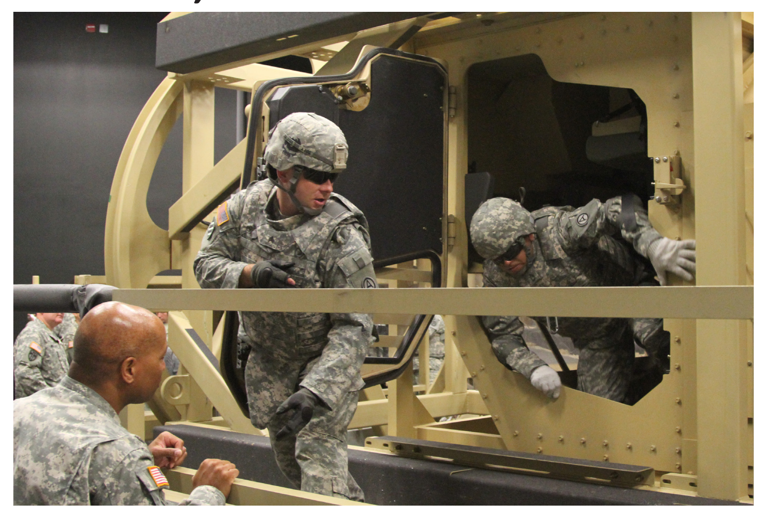
Soldiers from the 3rd Army Augmentation Unit exit themselves from an overturned vehicle during rollover training using large simulators at Fort Bliss, Texas July 9, 2014. Rollover training prepares Soldiers by teaching them how to properly react and still defend themselves in worst case scenarios.